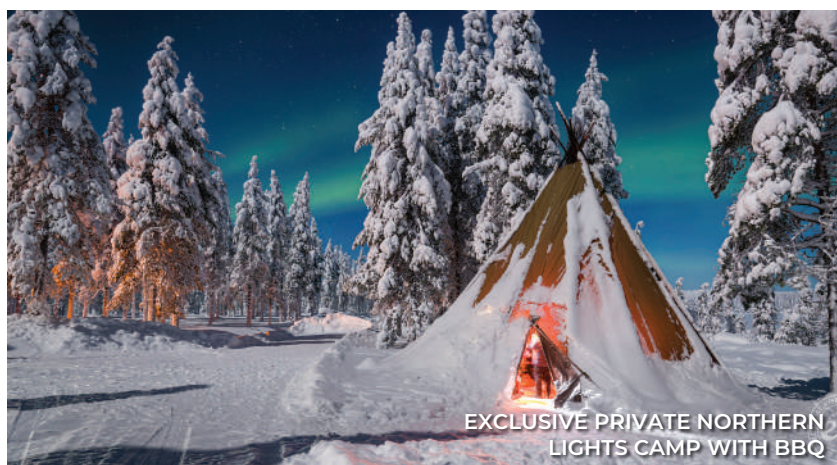
EXCLUSIVE PRIVATE NORTHERN LIGHTS CAMP WITH BBQ