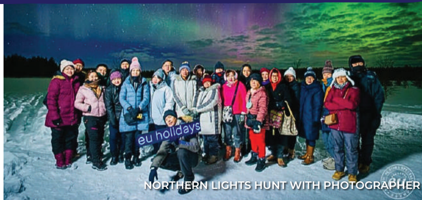
NORTHERN LIGHTS HUNT WITH PHOTOGRAPHER