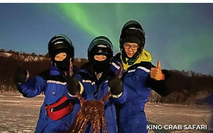
KING CRAB SAFARI