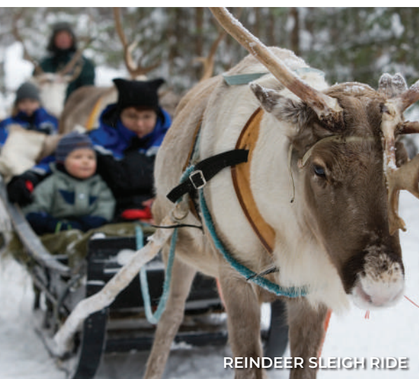
REINDEER SLEIGH RIDE