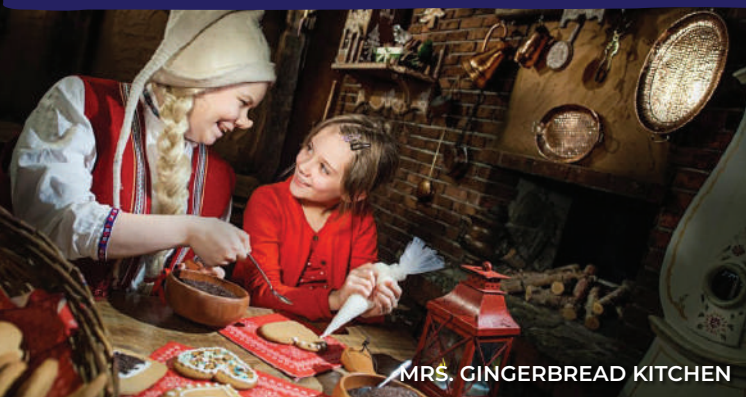
MRS. GINGERBREAD KITCHEN