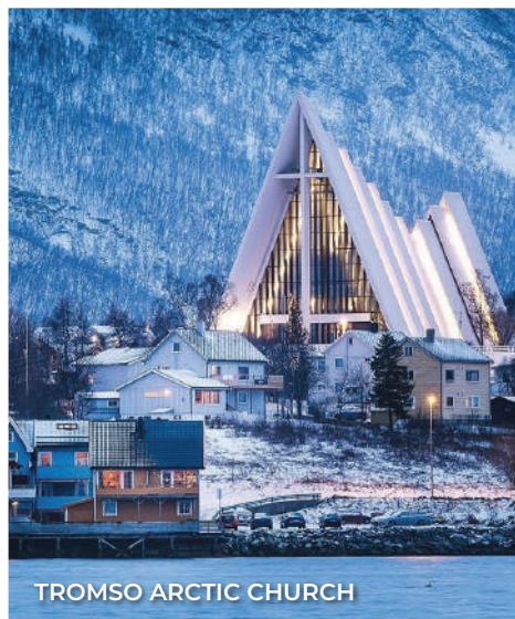
TROMSØ ARCTIC CHURCH

Explore the islands of Lofoten and savor the picturesque coastal views of Vestfjord as you journey through. Begin your adventure at the quaint fishing village of Henningsvær , where you can admire the stunning scenery of towering mountains set against