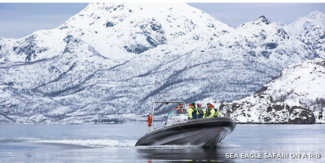
SEA EAGLE SAFARI ON A RIB