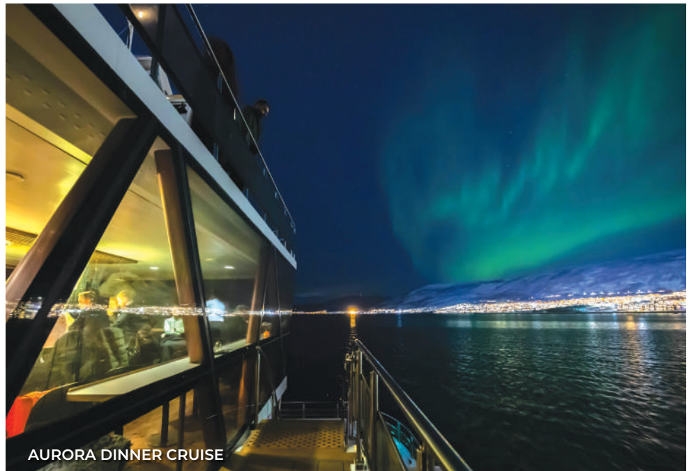
AURORA DINNER CRUISE

Note: Observing the Northern Lights cannot be guaranteed since it is a natural occurrence that depends on weather conditions. In the event Aurora Cruise Dinner is closed for maintenance, we will replace with hotel dinner.