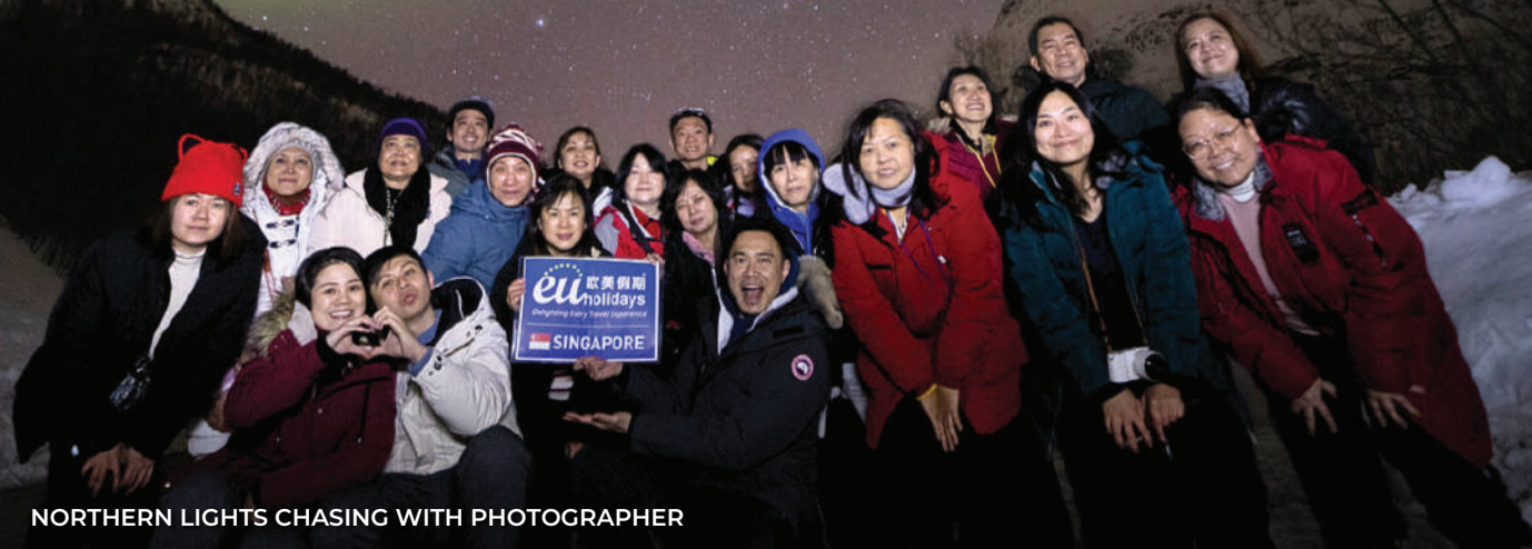
NORTHERN LIGHTS CHASING WITH PHOTOGRAPHER