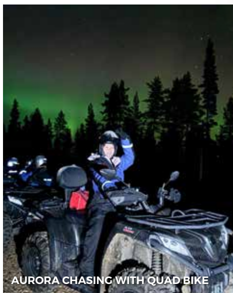
AURORA CHASING WITH QUAD BIKE