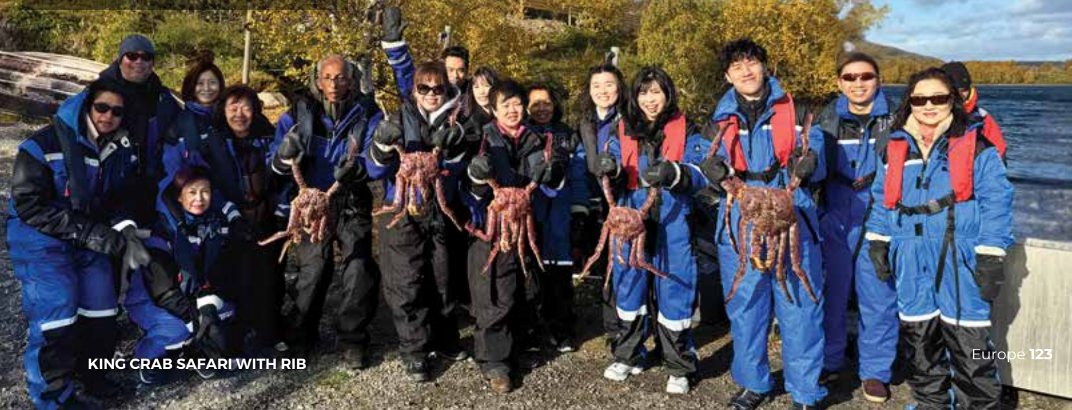
KING CRAB SAFARI WITH RIB