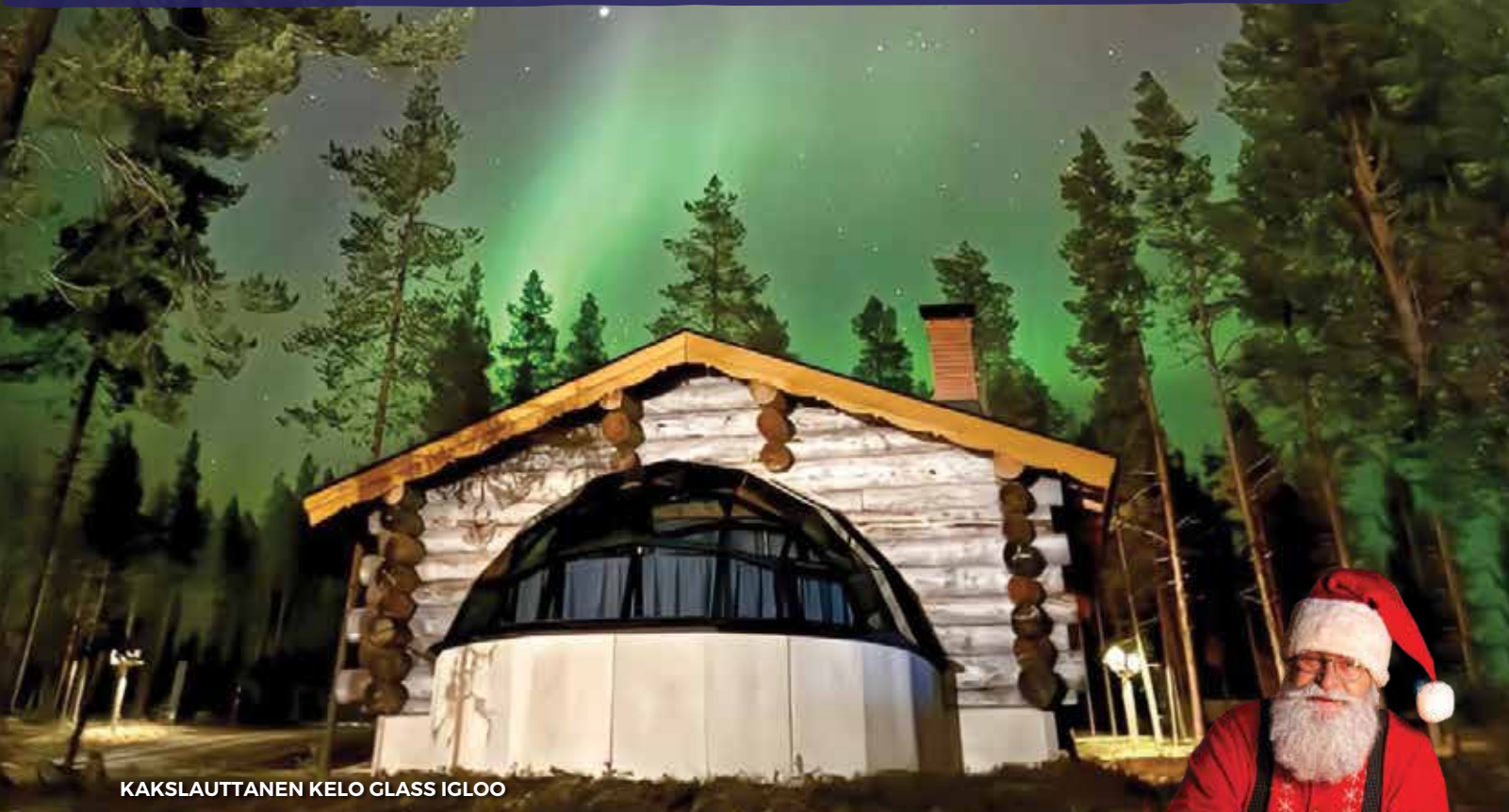
KAKSLAUTTANEN KELO GLASS IGLOO