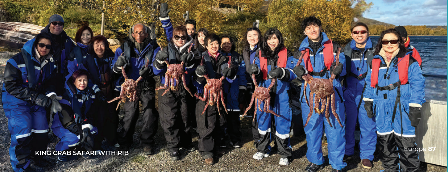
KING CRAB SAFARI WITH RIB