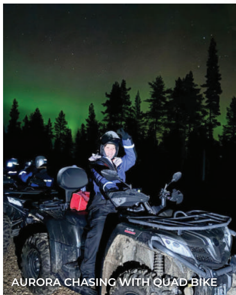
AURORA CHASING WITH QUAD BIKE