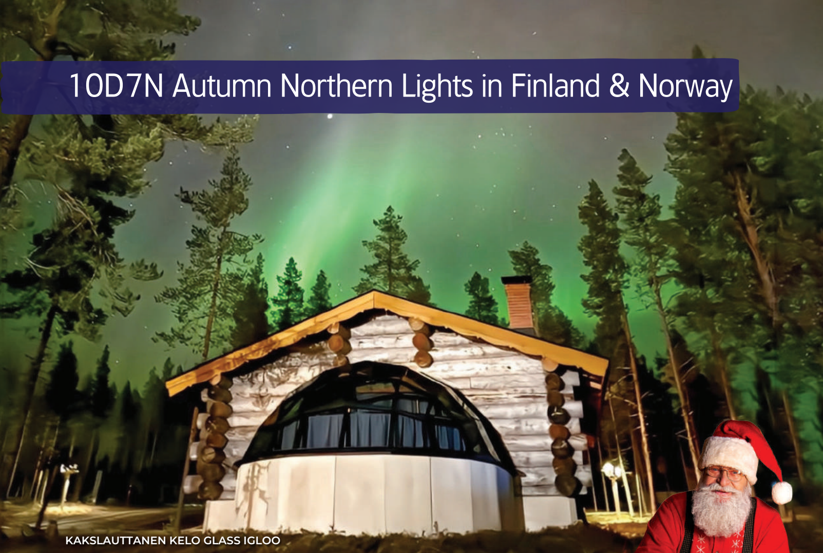
KAKSLAUTTANEN KELO GLASS IGLOO