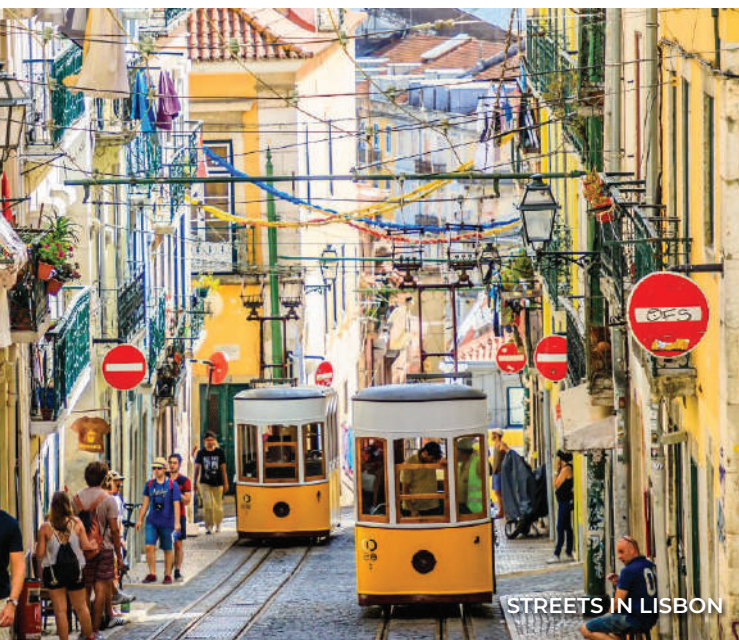
STREETS IN LISBON