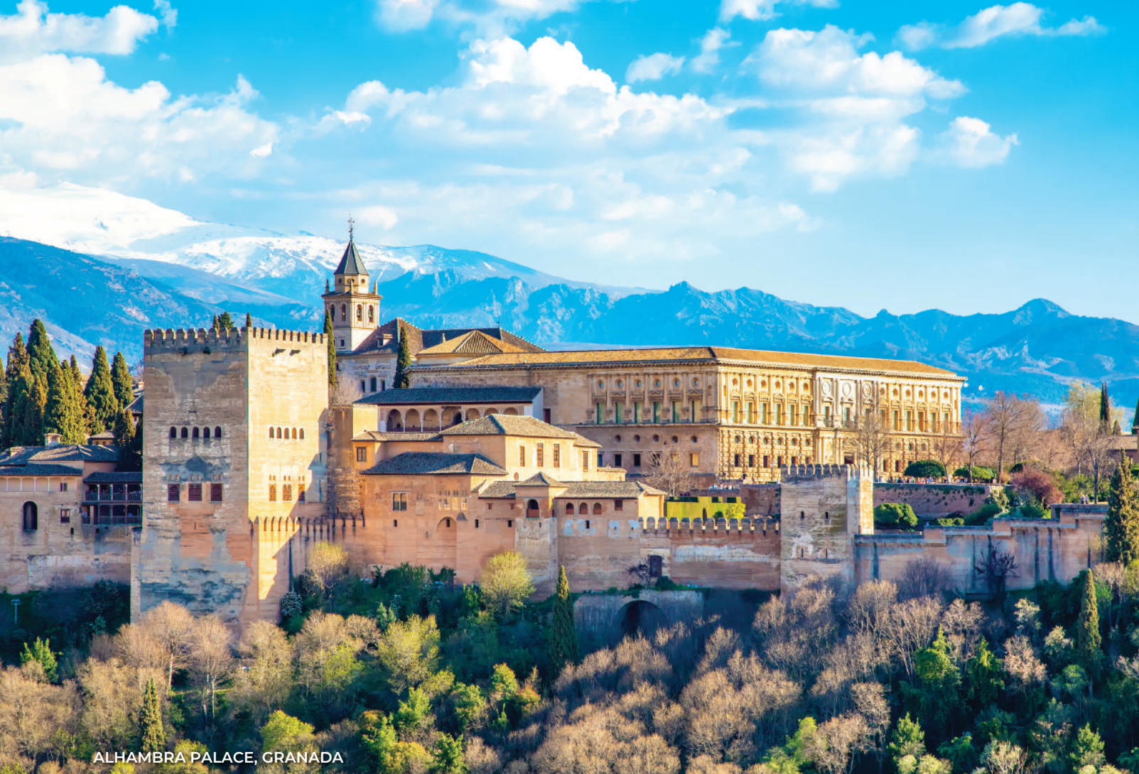
ALHAMBRA PALACE, GRANADA