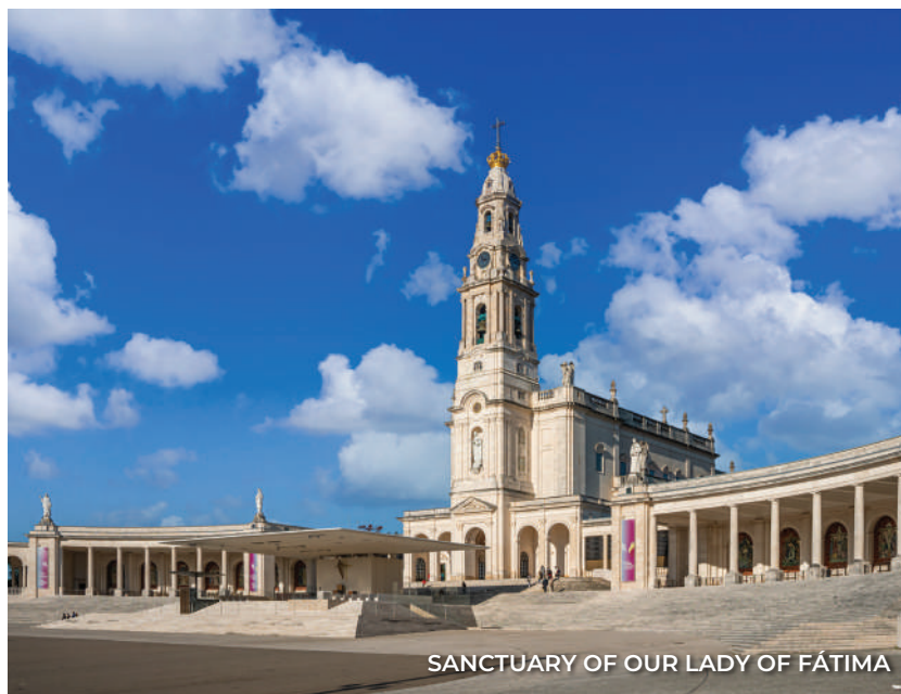
SANCTUARY OF OUR LADY OF FÁTIMA

Michelin-recommended restaurant, featuring signature Segovian roast suckling pig . After which, depart to Madrid . From luxury fashion brands to delectable gastronomy, indulge in some retail therapy at El Corte Inglés , Europe's largest department store chain. Receive a welcome VIP Rewards card complete with wine and tapas.