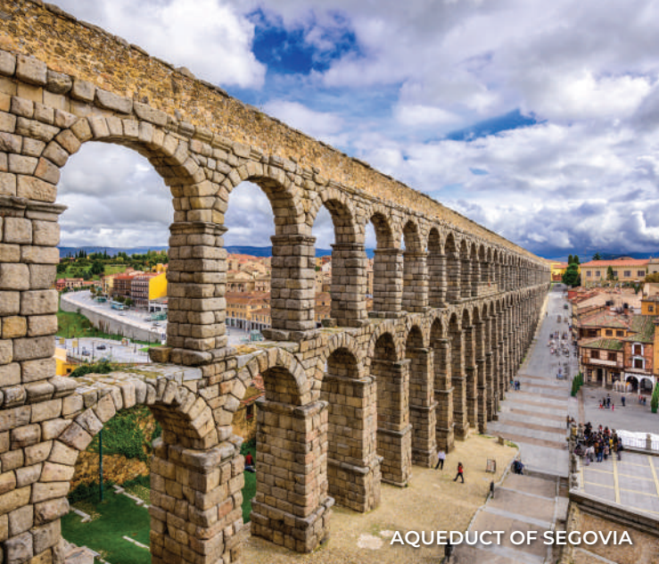
AQUEDUCT OF SEGOVIA