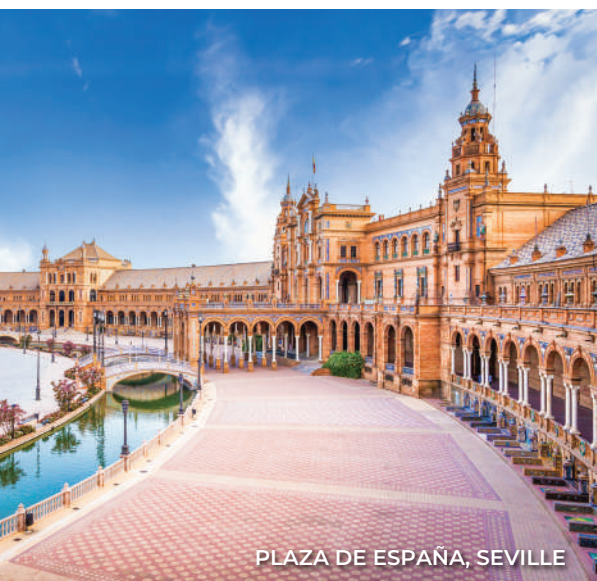
PLAZA DE ESPAÑA, SEVILLE

Paella, paired with a glass of white wine to elevate the flavors!