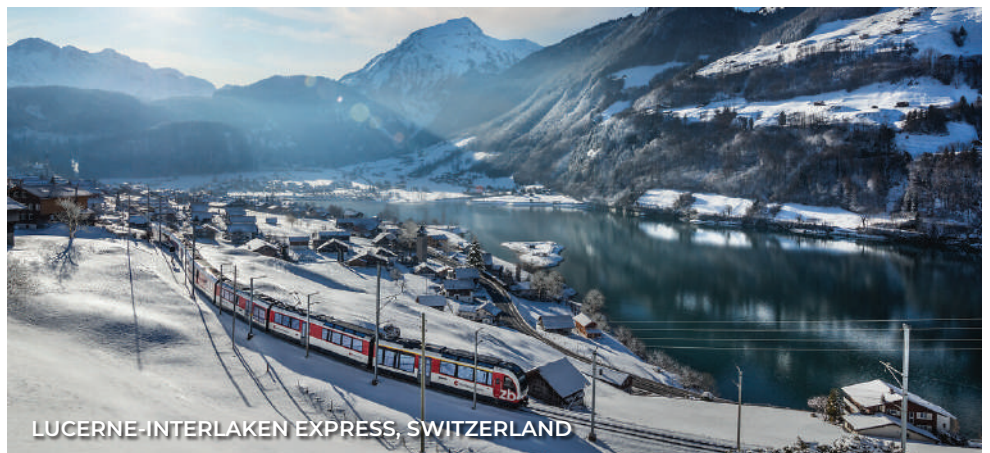
LUCERNE-INTERLAKEN EXPRESS, SWITZERLAND

Breakfast, Asian Buffet Dinner Discover the enchanting town of Colmar , where Alsatian heritage comes to life along medieval streets and colorful half-timbered houses dating back to the 16th century. Don't miss the picturesque Little Venice quarter, with its tranquil canals and postcard-worthy views.