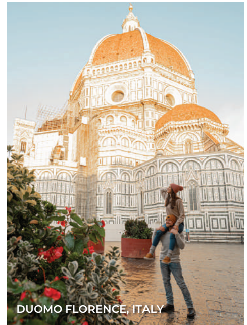
DUOMO FLORENCE, ITALY