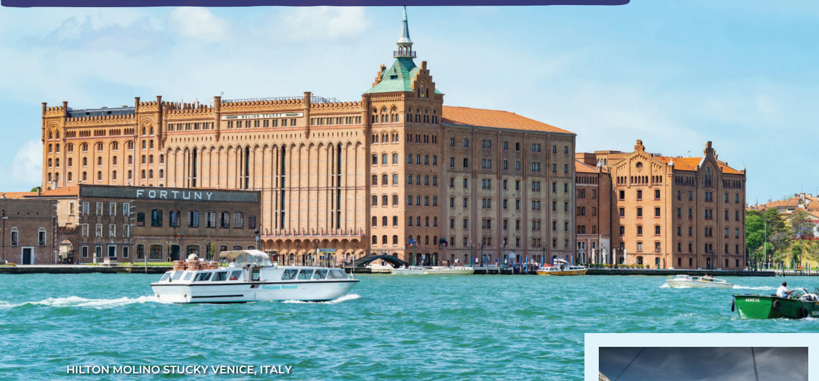
HILTON MOLINO STUCKY VENICE, ITALY