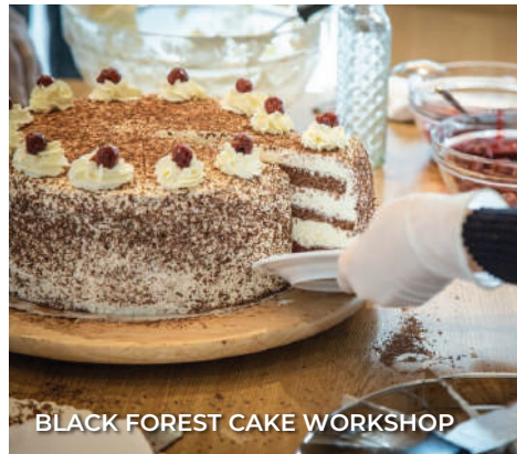
BLACK FOREST CAKE WORKSHOP

Breakfast Get ready for a day of excitement and adventure! Take a snow bus to Mt. Bussalp for breathtaking panoramic views from 1800m. Glide down the 7.6km sledge run, the longest in Europe, and enjoy stunning vistas of the Jungfrau's snowy peaks. You may also choose to join our optional scenic railway journey to Kleine Scheidegg for spectacular views of the valleys and the Glacier Falls. Optional: Kleine Scheidegg Note: In case of unfavorable weather conditions, the sledding activities may be replaced with visit to Grindelwald First / Pilatus / Harder Kulm.