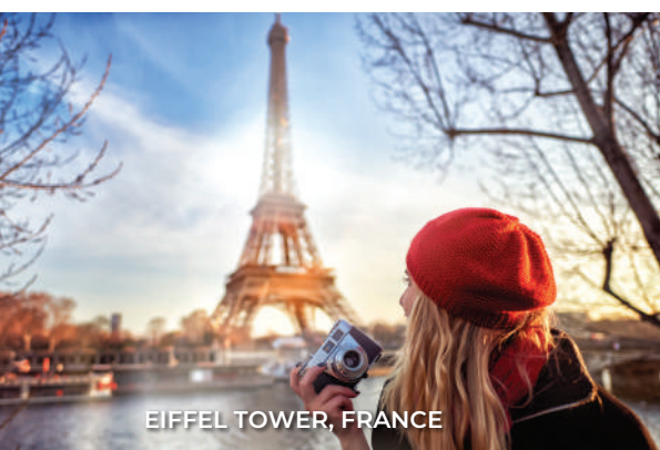
EIFFEL TOWER, FRANCE