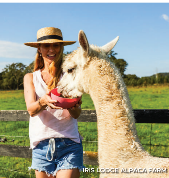
IRIS LODGE ALPACA FARM