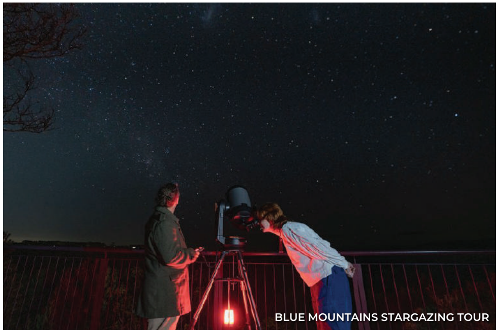
BLUE MOUNTAINS STARGAZING TOUR

Start the morning at Echo Point Lookout for sweeping views over the Jamison Valley and the iconic Three Sisters Rock Formation . Next, enjoy an included Scenic World Discovery Pass to experience breathtaking rides – Skyway, Cableway and Scenic Railway – offering unique