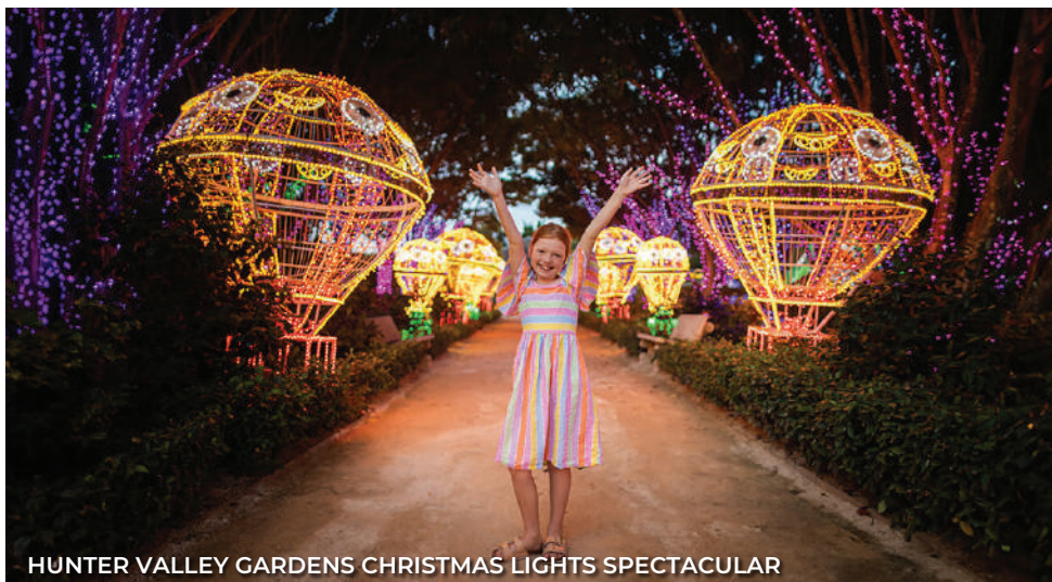
HUNTER VALLEY GARDENS CHRISTMAS LIGHTS SPECTACULAR

Begin the day at the Newcastle Memorial Walk , a coastal clifftop path commemorating ANZAC soldiers with spectacular ocean views. Continue to Earp Distilling Co. and take part in a unique DIY Blending Workshop , a guided hands-on session where you craft your own personalised 200ml spirit blend of gin, vodka, or rum. Next, enjoy a delightful visit to Iris Lodge Alpaca Farm for a chance to meet and feed alpacas, sheep, and other farm animal. This evening, indulge in a unique dining experience at SkyFeast , perched atop the tallest revolving restaurant in the Southern Hemisphere.