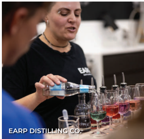
EARP DISTILLING CO.

perspectives of the ancient rainforest and sandstone cliffs. Continue to Leura Village , a quaint township known for its boutique shops and charming gardens. Later, visit the whimsical Bygone Beautys Treasured Teapot Museum & Tearooms and enjoy a Devonshire Tea served with freshly baked scones.