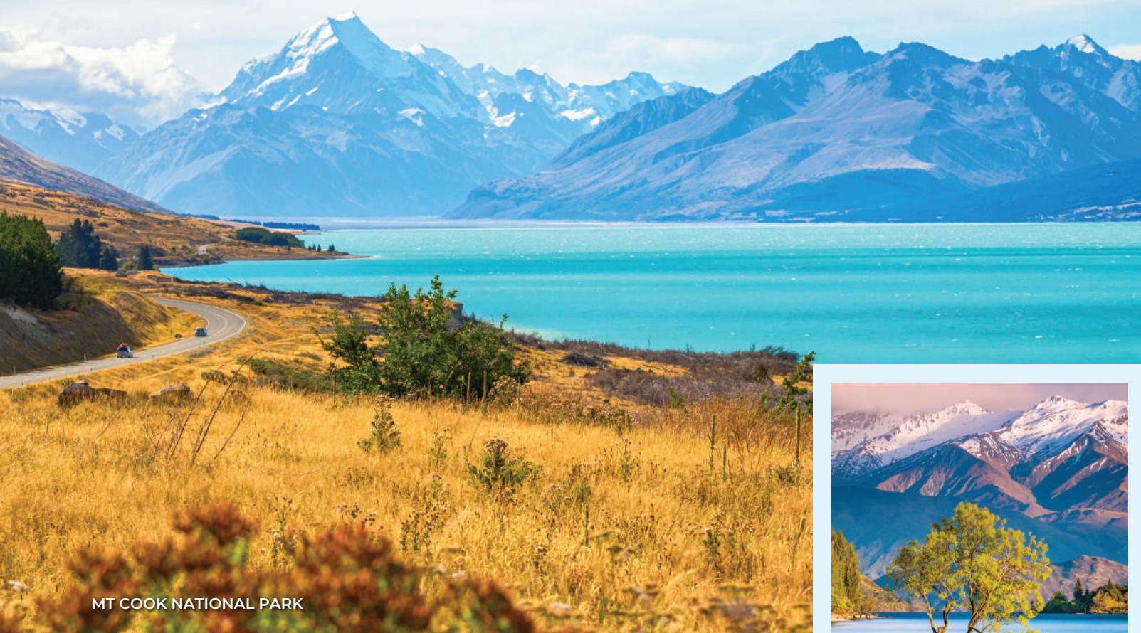
MT COOK NATIONAL PARK