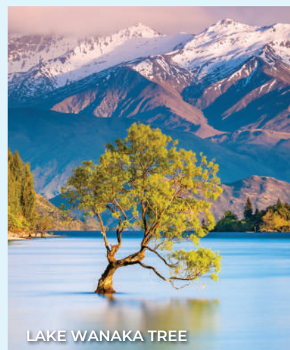
LAKE WANAKA TREE

Note: Breakfast box will be provided for early departure.