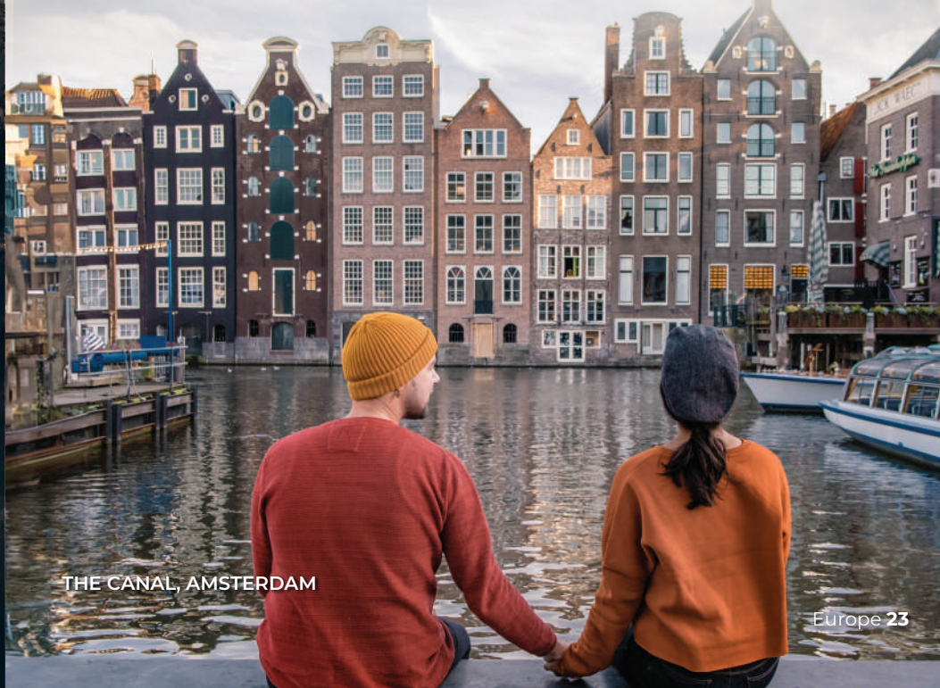
THE CANAL, AMSTERDAM

*Note: Hotels subject to final confirmation. Should there be changes, customers will be offered similar accommodations as stated in this list.