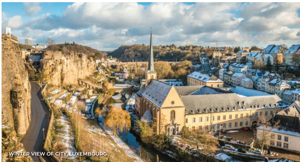
WINTER VIEW OF CITY, LUXEMBOURG

Travel to Cologne and marvel at the towering Cologne Cathedral , Northern Europe's largest Gothic church, with its impressive 157m twin spires. Then, continue to Luxembourg for a walking tour starting at Place Guillaume II . Explore highlights such as the Grand Ducal Palace , the scenic Corniche , often called 'the most beautiful balcony in Europe', the historic Bock Promontory , and the stunning Notre-Dame Cathedral .