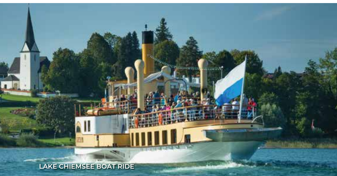
LAKE CHIEMSEE BOAT RIDE