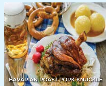
BAVARIAN ROAST PORK KNUCKLE