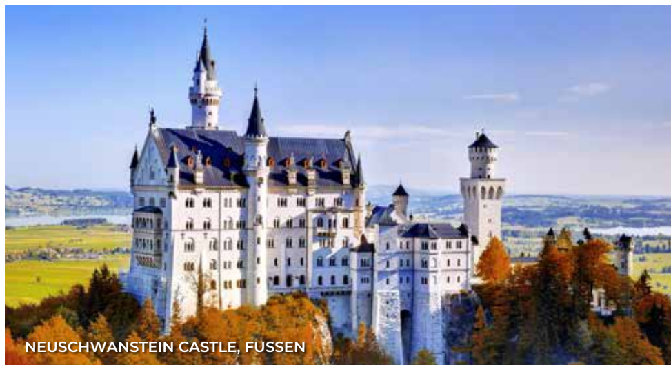
NEUSCHWANSTEIN CASTLE, FUSSEN