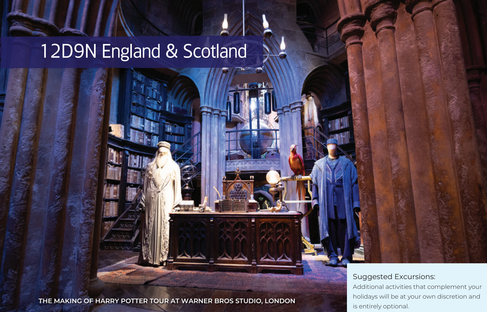
THE MAKING OF HARRY POTTER TOUR AT WARNER BROS STUDIO, LONDON