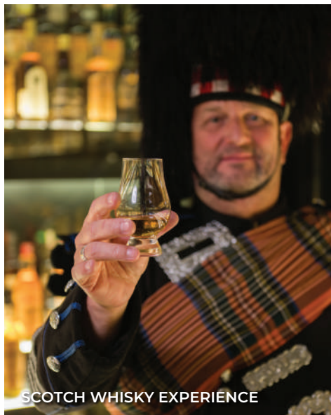
SCOTCH WHISKY EXPERIENCE