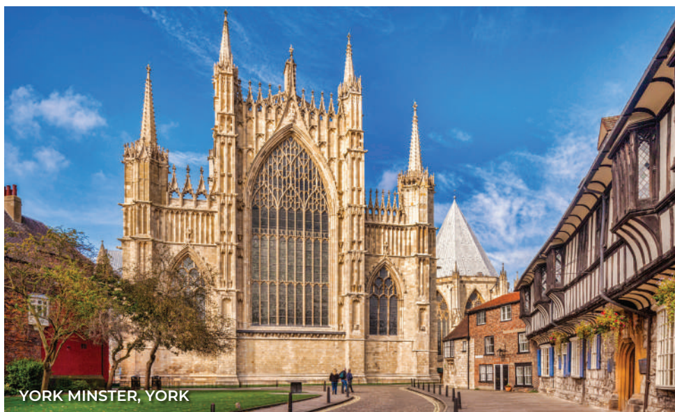
YORK MINSTER, YORK