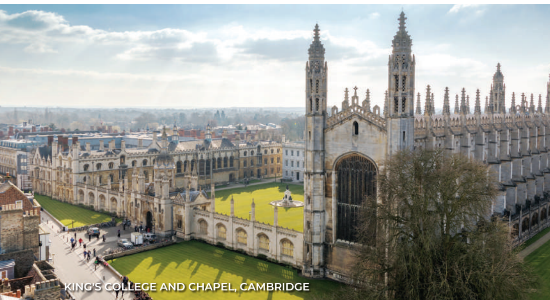
KING'S COLLEGE AND CHAPEL, CAMBRIDGE