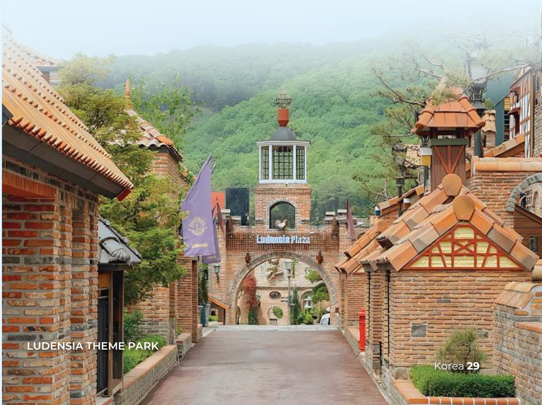
LUDENSIA THEME PARK