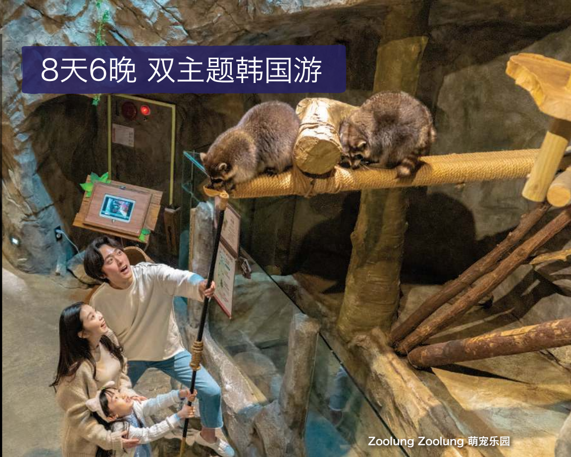
Zoolung Zoolung 萌宠乐园