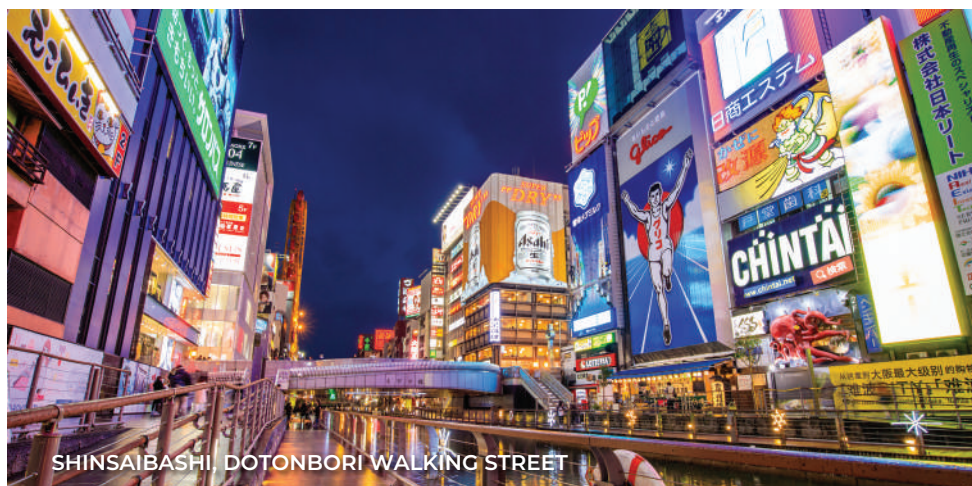
SHINSAIBASHI, DOTONBORI WALKING STREET

UNESCO-listed Shirakawa-go Village Light-up Festival. Experience the enchanting beauty of the traditional thatched-roof houses as they are illuminated by thousands of twinkling lights, creating a magical atmosphere that is truly unforgettable. Immerse yourself in the rich cultural heritage of this world-renowned event and capture stunning photos of the picturesque scenery that will leave you in awe.