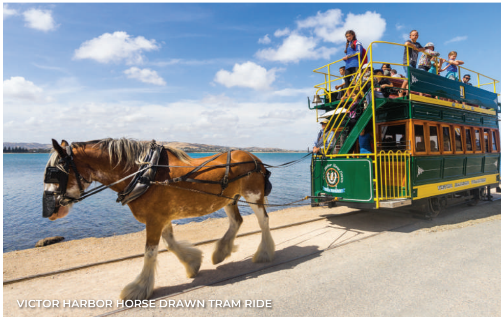
VICTOR HARBOR HORSE DRAWN TRAM RIDE

Awake to a delightful breakfast in the heart of the Barossa Valley , South Australia's wine crown jewel. Visit the scenic Lyndoch Lavender Farm , offering a serene atmosphere where you can explore lavender-inspired products, unwind in the peaceful countryside, and enjoy the calming surroundings. Then, embark on a wine tasting at Yalumba Vineyard , where you can savor the rich flavors of locally crafted wines in a charming and inviting setting. Satisfy your sweet tooth at the Barossa Valley Chocolate Company , a paradise of handcrafted chocolates and sweet treats, and then indulge in the rich flavors of the Barossa Valley Cheese Company , where artisanal cheeses offer a taste of the region's heritage.