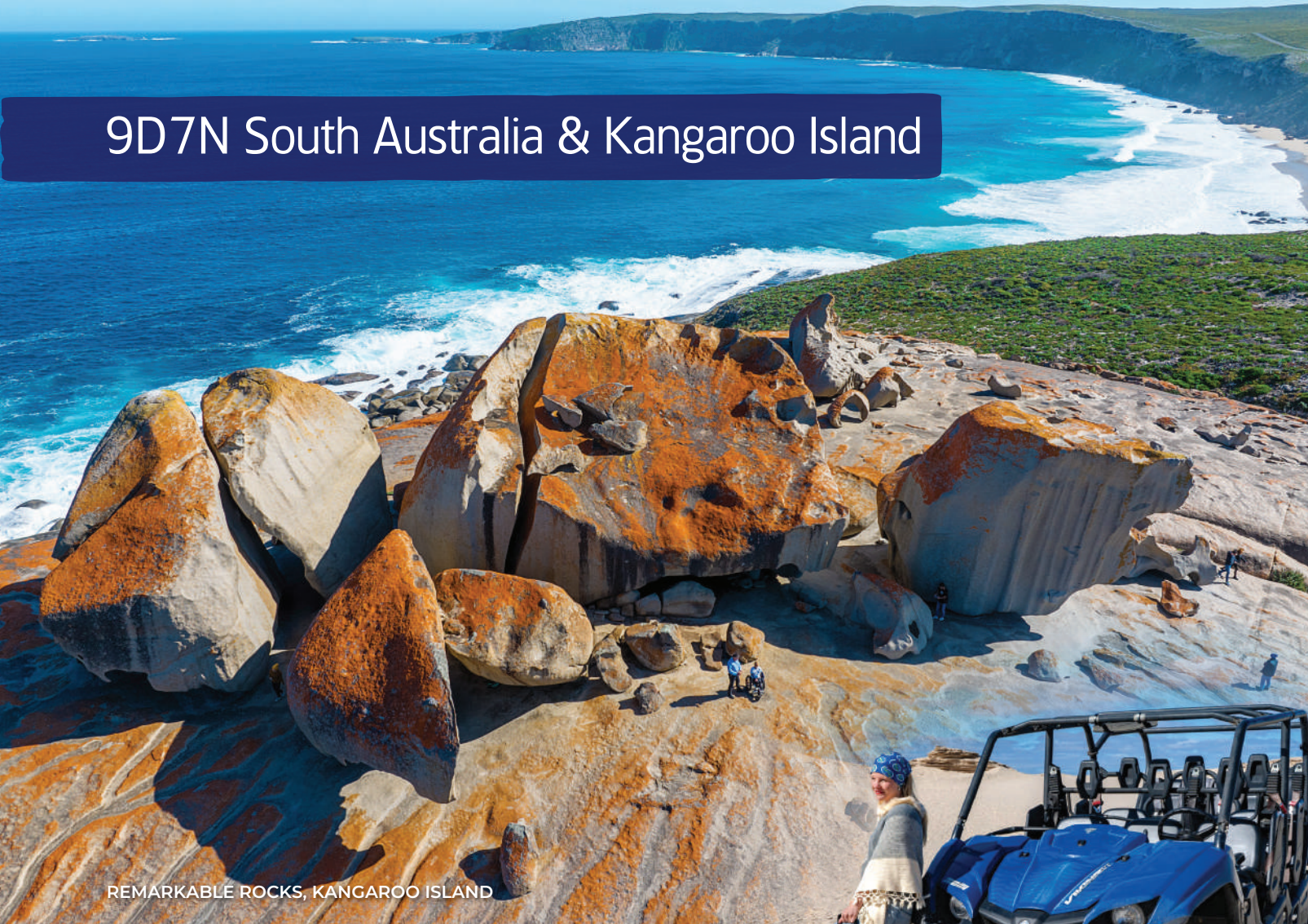
REMARKABLE ROCKS, KANGAROO ISLAND