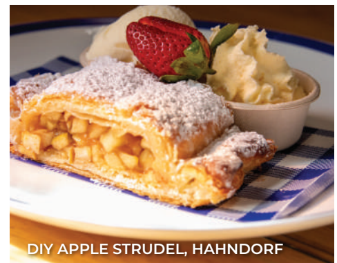
DIY APPLE STRUDEL, HAHNDORF

After breakfast, travel to Hahndorf , Australia's oldest German village, filled with charm, heritage, and culinary delights. Engage in a hands-on apple strudel-making workshop and craft a delicious pastry to remember. Visit the Beerenberg Family Farm , a charming destination known for its farm-fresh jams, relishes, and a variety of homemade preserves, all crafted with the finest local ingredients. Then, head to the renowned Jurlique Farm , where organic skincare is naturally grown and harvested.