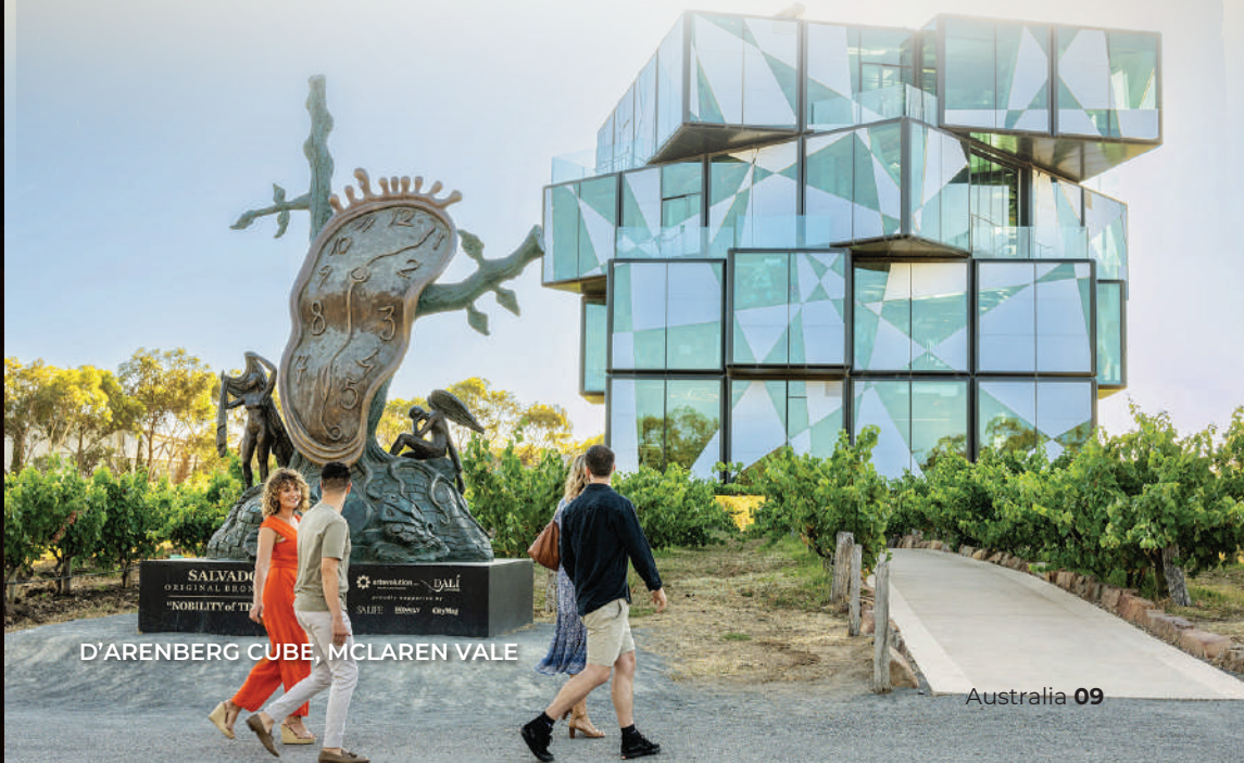
D'ARENBERG CUBE, MCLAREN VALE

*Note: Hotel subject to final confirmation. Should there be changes, customers will be offered similar accommodation to the list.