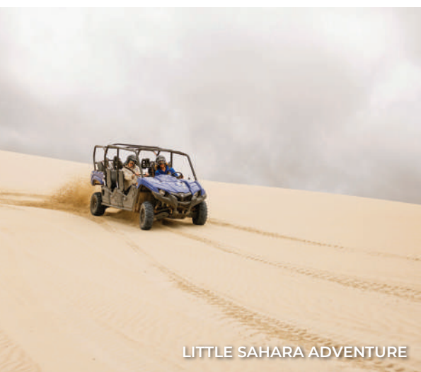
LITTLE SAHARA ADVENTURE

Island and return to the mainland by ferry. Travel to the coastal town of Victor Harbor , known for its stunning ocean views and laid-back charm. Enjoy a scenic ride on the historic Horse Drawn Tram to Granite Island Recreation Park , offering panoramic views of the coastline. Continue your journey to McLaren Vale , where you'll stop at the iconic d'Arenberg Cube , an architectural masterpiece renowned for its bold design and innovative concept.