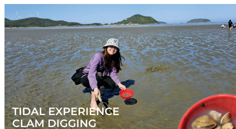
TIDAL EXPERIENCE CLAM DIGGING

After breakfast, have your last minute shopping at Liver Shop and Gwangjang Market before your transfer to Incheon International Airport for your flight back to Singapore.