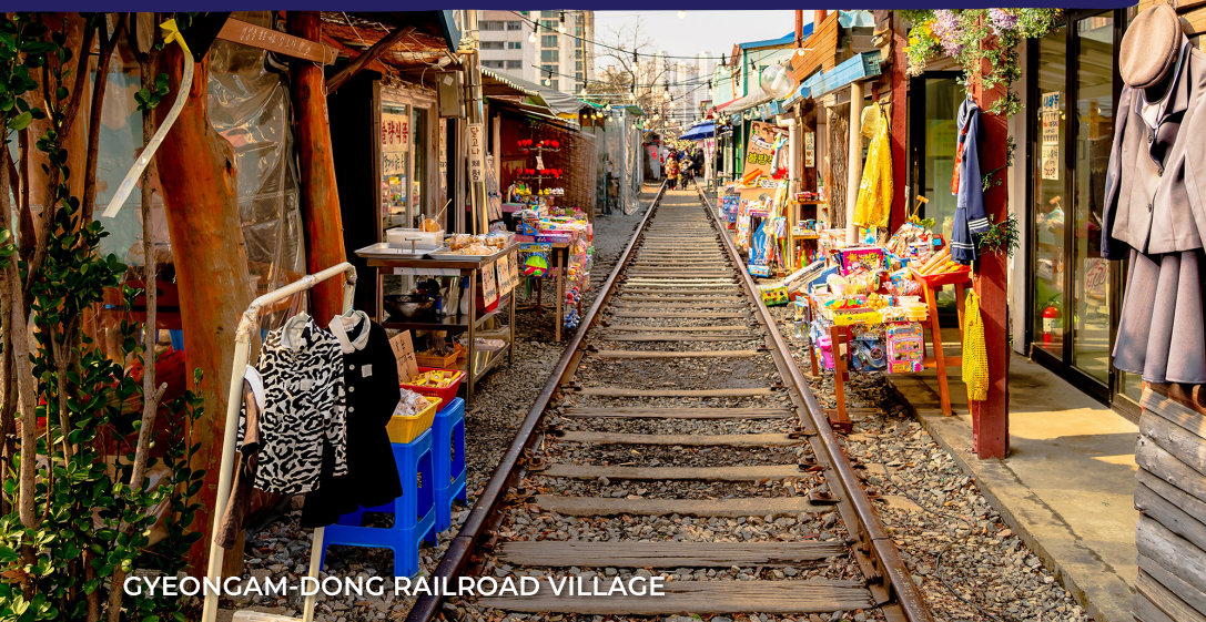
GYEONGNAM-DONG RAILROAD VILLAGE