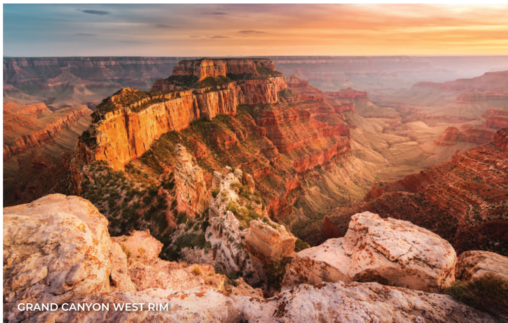
GRAND CANYON WEST RIM