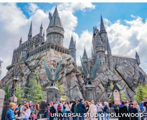
UNIVERSAL STUDIO HOLLYWOOD

awe-inspiring natural landscape. Take the time to visit iconic sights like El Capitan , renowned among climbers worldwide, and the imposing Half Dome , which dominates the skyline. Don't miss the breathtaking views from Tunnel View or the serene beauty of the Merced River . After your visit to Yosemite, continue your journey to the lively city of San Francisco . As you approach, admire the city's iconic skyline, a perfect blend of historical charm and modern vibrance.