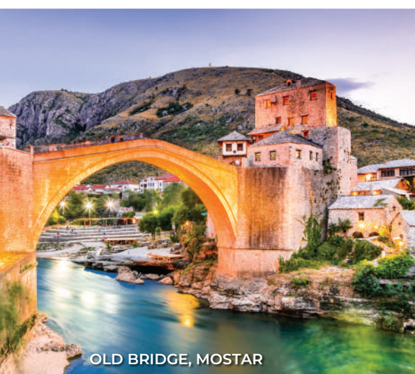
OLD BRIDGE, MOSTAR

and the Red Hall. Press on further to view the renowned stalagmites in the Brilliant Passage and get a look at the Vivarium Proteus , otherwise known as the human fish. Finally, head to the capital of Slovenia, Ljubljana .