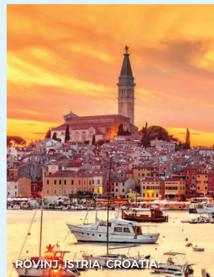
ROVINJ, ISTRIA, CROATIA

We hope you enjoyed your trip with our company and we look forward to seeing you again for your next trip.