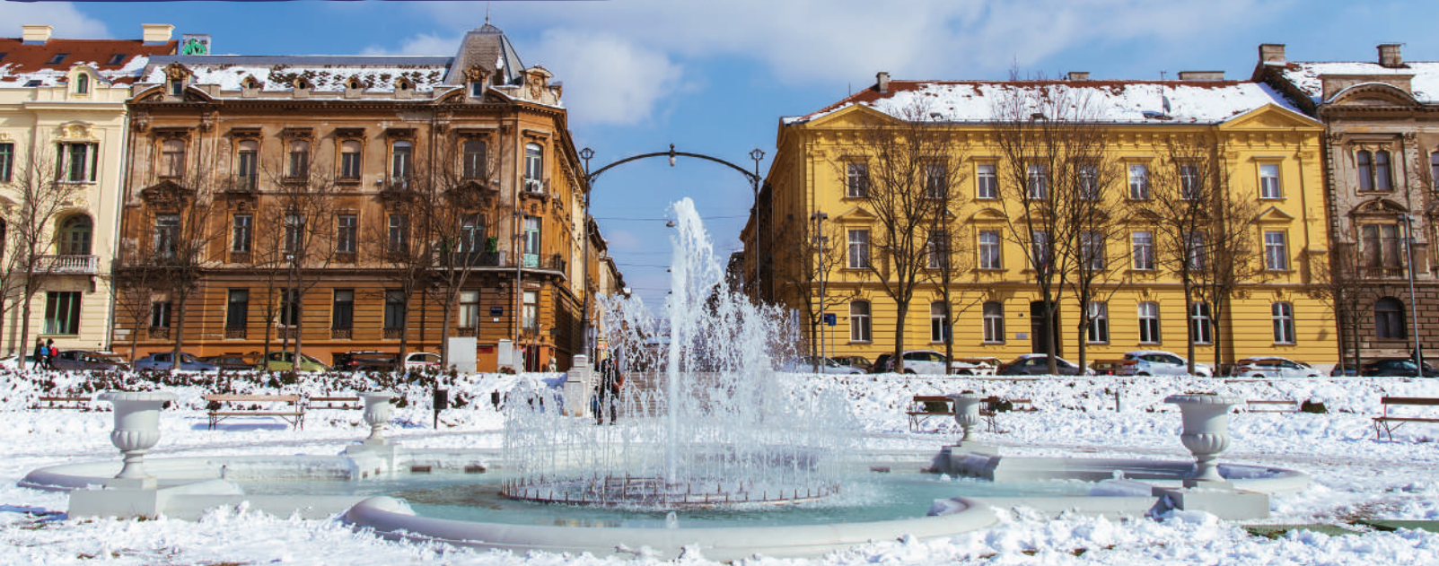
KING TOMISLAV SQUARE, CROATIA