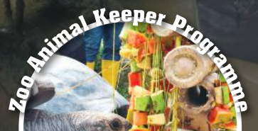
Zoo Animal Keeper Programme 动物饲养员义工