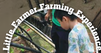
Little Farmer Farming Experience 小农夫农耕体验