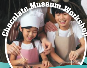
Chocolate Museum Workshop 巧克力博物馆工坊