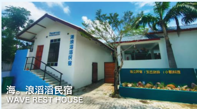
海。浪滔滔民宿 WAVE REST HOUSE