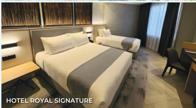
HOTEL ROYAL SIGNATURE