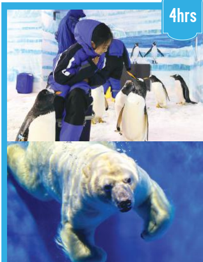
Harbin Polarland Little Explorer Learning

The Harbin Polarland is a large indoor polar-themed park centered around the Arctic and Antarctic. Visitors can observe marine life from both polar regions and participate in engaging activities such as an Arctic exploration course and an immersive Arctic research station experience. Enjoy a polar park lunch and take part in highlights like a park parade, close encounters with polar bears, Arctic foxes, penguins. Don't miss the breathtaking underwater beluga whale performance and spectacular shows featuring a variety of polar marine creatures, animals, and talented Russian performers. Guests can also enjoy feeding adorable squirrel monkeys and seals.