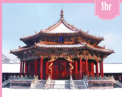
Shenyang Imperial Palace Museum

The Shenyang Imperial Palace, originally built and used as a royal residence during the early Qing Dynasty, was constructed in 1625. It features over 100 architectural structures, including palaces, pavilions, towers, and halls, with more than 500 rooms in total. The museum houses a collection of over 100,000 cultural relics, offering significant historical and artistic value while showcasing its unique characteristics.