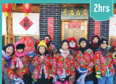
Dongbei Village Cultural Experience

The Changchun Film Studio Site Museum chronicles the inception, development, prosperity, and transformations of the Changchun Film Studio, serving as a witness to the history of New China's cinema. It was here that the first multi-episode news documentary, the first puppet film, the first science education film, the first animated film, the first short story film, the first feature-length film, and the first dubbed film of New China were produced.