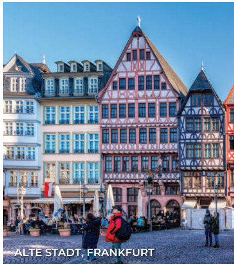
ALTE STADT, FRANKFURT

Breakfast, Dinner – Choucroute Garnie Start your day with a shopping spree at Wertheim Village , a chic open-air outlet offering over 110 boutiques with discounts of up to 60% on luxury brands. Cross into France and arrive in Strasbourg , where you'll unwind with an overnight stay in this enchanting Alsatian city.