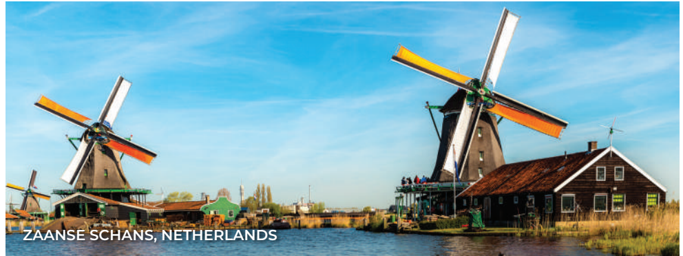
ZAANSE SCHANS, NETHERLANDS