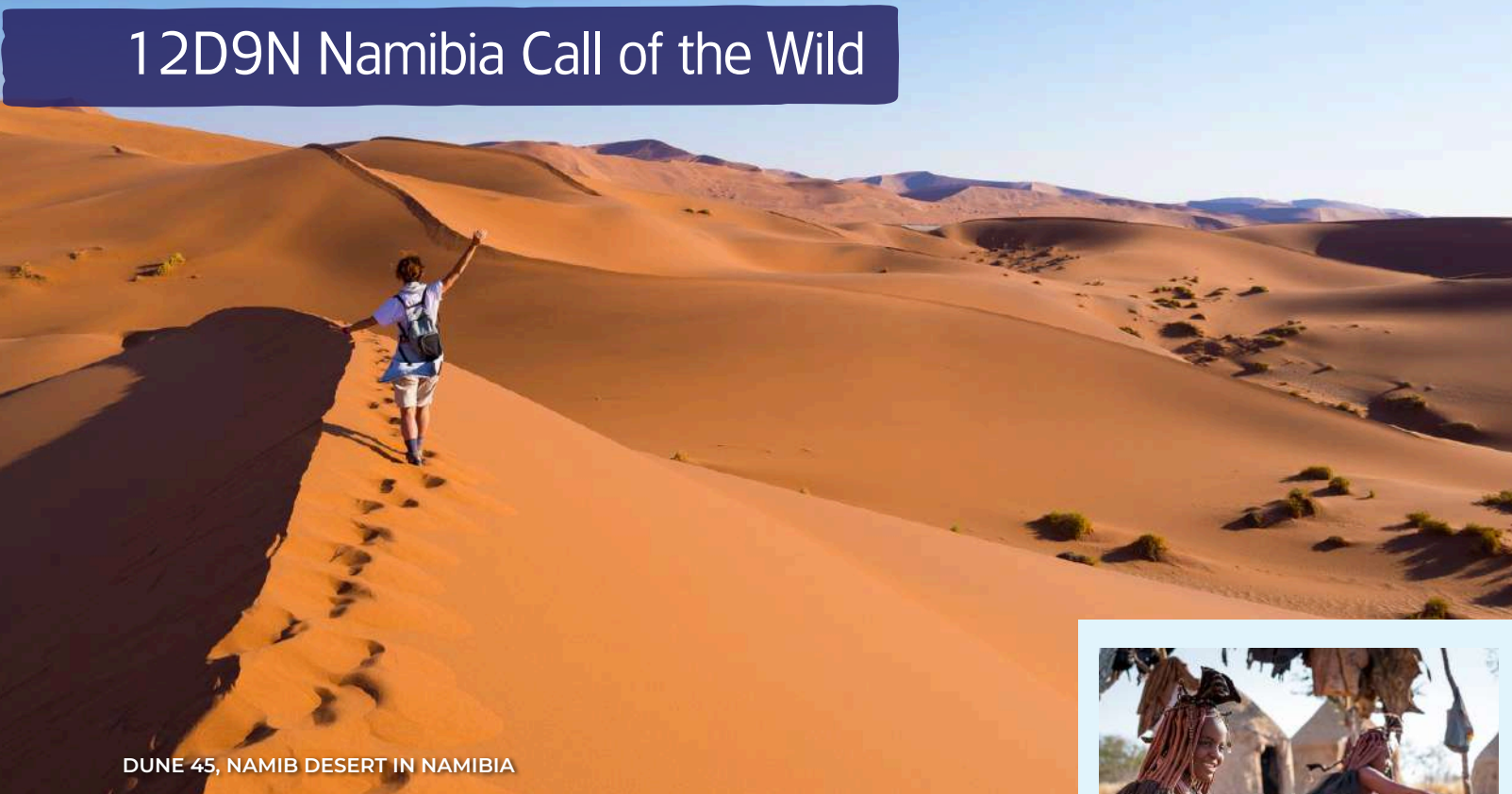
DUNE 45, NAMIB DESERT IN NAMIBIA