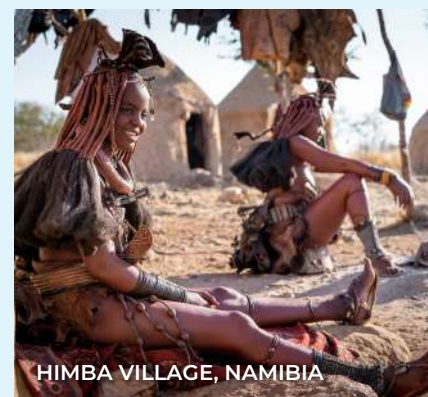
HIMBA VILLAGE, NAMIBIA

We hope you enjoyed your trip with our company and we look forward to seeing you again for your next trip.