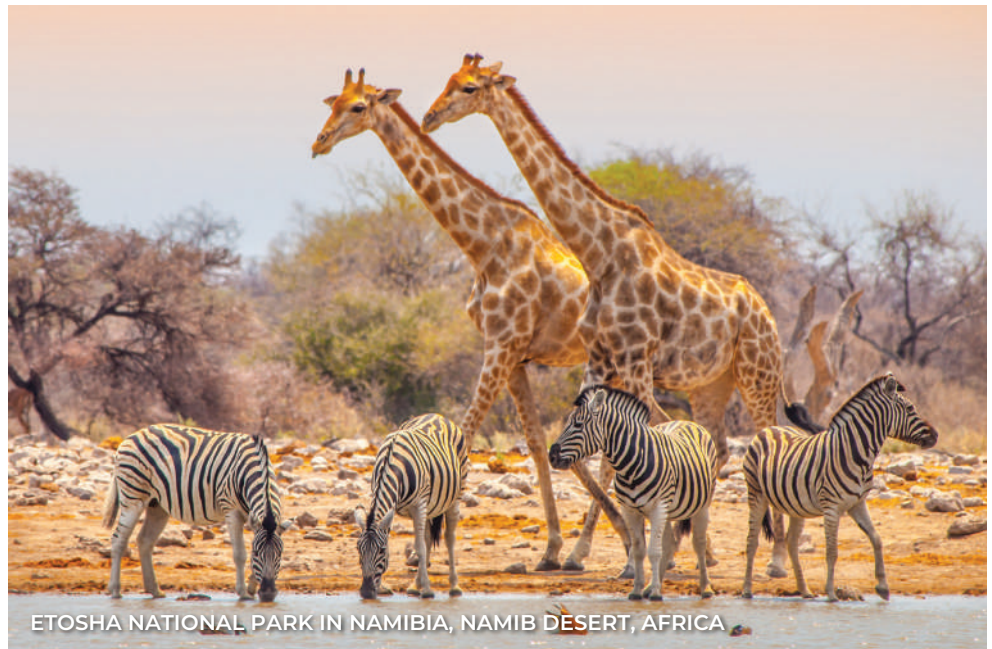
ETOSHA NATIONAL PARK IN NAMIBIA, NAMIB DESERT, AFRICA

Start your morning with an early game drive in Etosha National Park , one of Africa's finest wildlife reserves. Look out for elephants, lions, giraffes, zebras, and various antelope species gathering at the park's waterholes. After breakfast, depart Etosha and journey southwest toward Twyfelfontein , a UNESCO World Heritage Site known for its ancient Bushman rock engravings . En route, enjoy a special visit to a traditional Himba village , where you'll meet members of the semi-nomadic Himba tribe —famous for their red ochre skin and elaborate braided hairstyles. This respectful cultural visit offers unique insight