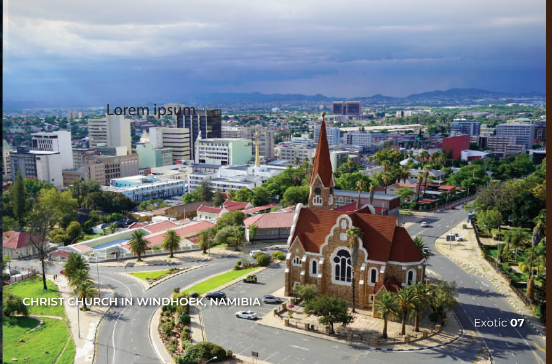
CHRIST CHURCH IN WINDHOEK, NAMIBIA

*Note: Hotels are subject to final confirmation. Should there be changes, customers will be offered similar accommodations as stated in this list. Hotels in South Africa do not have triple-share rooms.