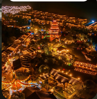
梦幻仙境灯光秀 - 葛仙村夜景