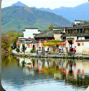
《卧虎藏龙》取景地 - 宏村