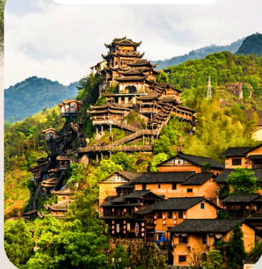
悬崖云端秘境 - 望仙谷