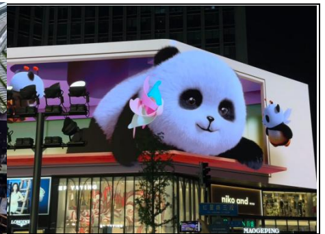
春熙路 / 太古里 / IFS