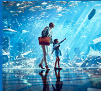
THE LOST CHAMBERS AQUARIUM, ATLANTIS