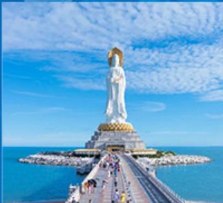
NANSHAN CULTURAL TOURISM ZONE