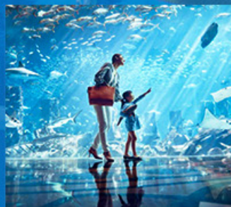
亚特兰蒂斯失落的空间水族馆 THE LOST CHAMBERS AQUARIUM, ATLANTIS