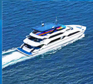
SANYA BAY NIGHT CRUISE