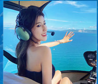
HELICOPTER 1KM RIDE