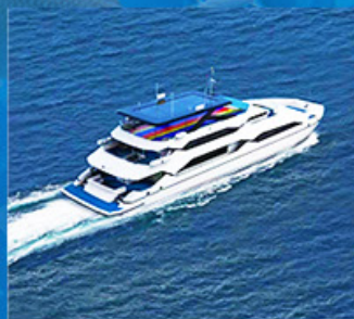
船游三亚湾 SANYA BAY NIGHT CRUISE