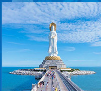
南山海上观音 NANSHAN CULTURAL TOURISM ZONE