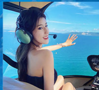
HELICOPTER 1KM RIDE