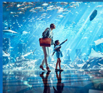
THE LOST CHAMBERS AQUARIUM, ATLANTIS