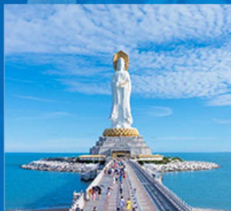
NANSHAN CULTURAL TOURISM ZONE