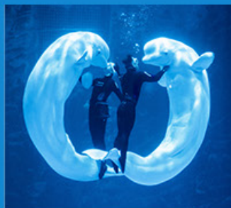
童世界海洋乐园 OCEAN PARADISE