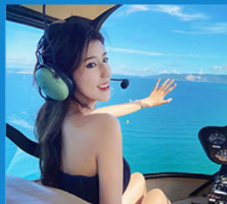
直升机1KM体验 HELICOPTER 1KM RIDE