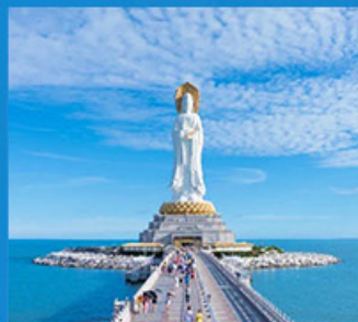
南山海上观音 NANSHAN CULTURAL TOURISM ZONE