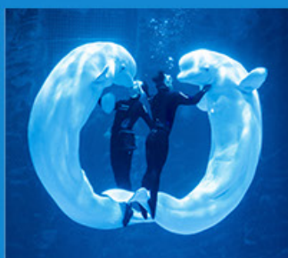
童世界海洋乐园 OCEAN PARADISE