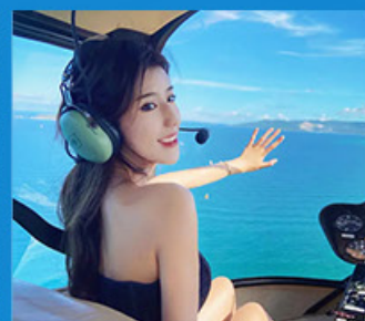
直升机1KM体验 HELICOPTER 1KM RIDE