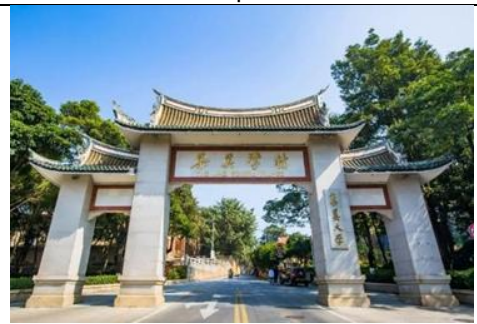
Jimei School Village