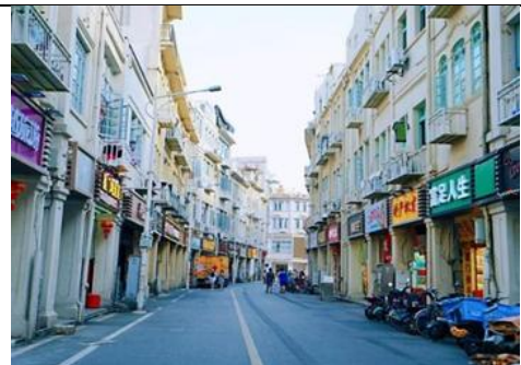
Longtou Road Commercial Street