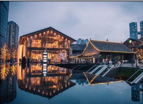
春熙路 / 太古里

早上睡到自然醒。午餐后，逛街自由活动，漫步 春熙路 / 太古里 感受成都潮流时尚与烟火人间的完美结合。傍晚，在 锦里古街 漫步成都最具古风的街巷，品尝地道小吃，体验三国文化氛围，之后就前往机场准备回家。