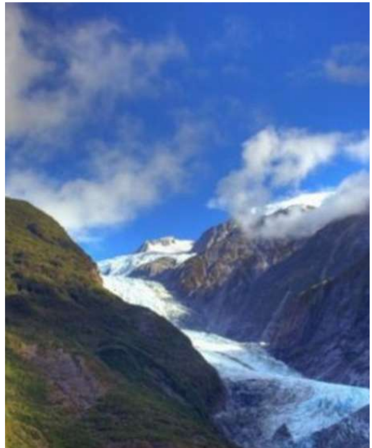
📍 Franz Josef Glacier

Choices of hotel for Standard, Superior or First Class