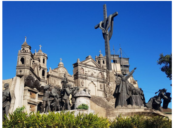
📍 CEBU HERITAGE MONUMENT

Thank you very much for choosing Nam Ho Travel as your preferred agent for your vacation. We hope to see you soon in the near future.