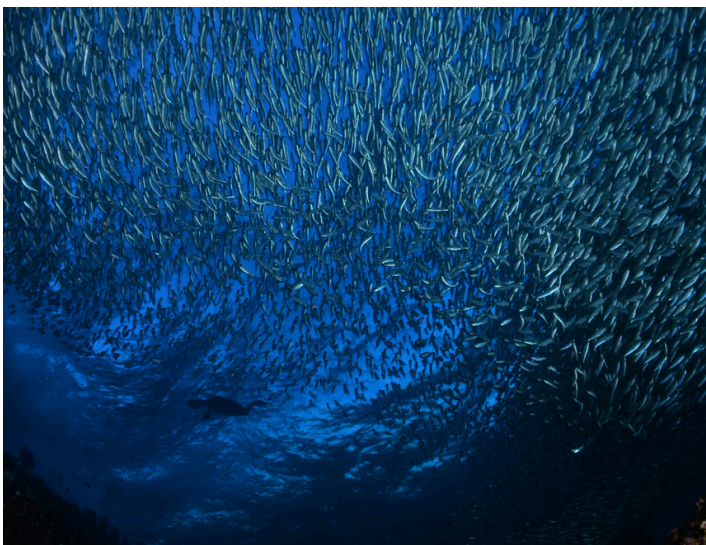
📍 SARDINES RUN