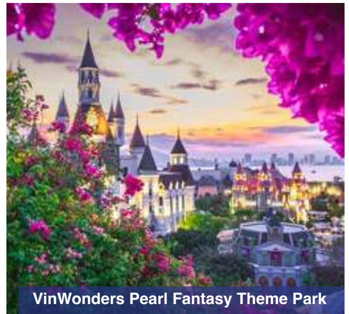
VinWonders Pearl Fantasy Theme Park

The Charm of Venice , Vietnam's largest water-based multimedia art show, which draws inspiration from the Carnival of Venice and European culture, offering a mesmerizing spectacle of light, music and dance.