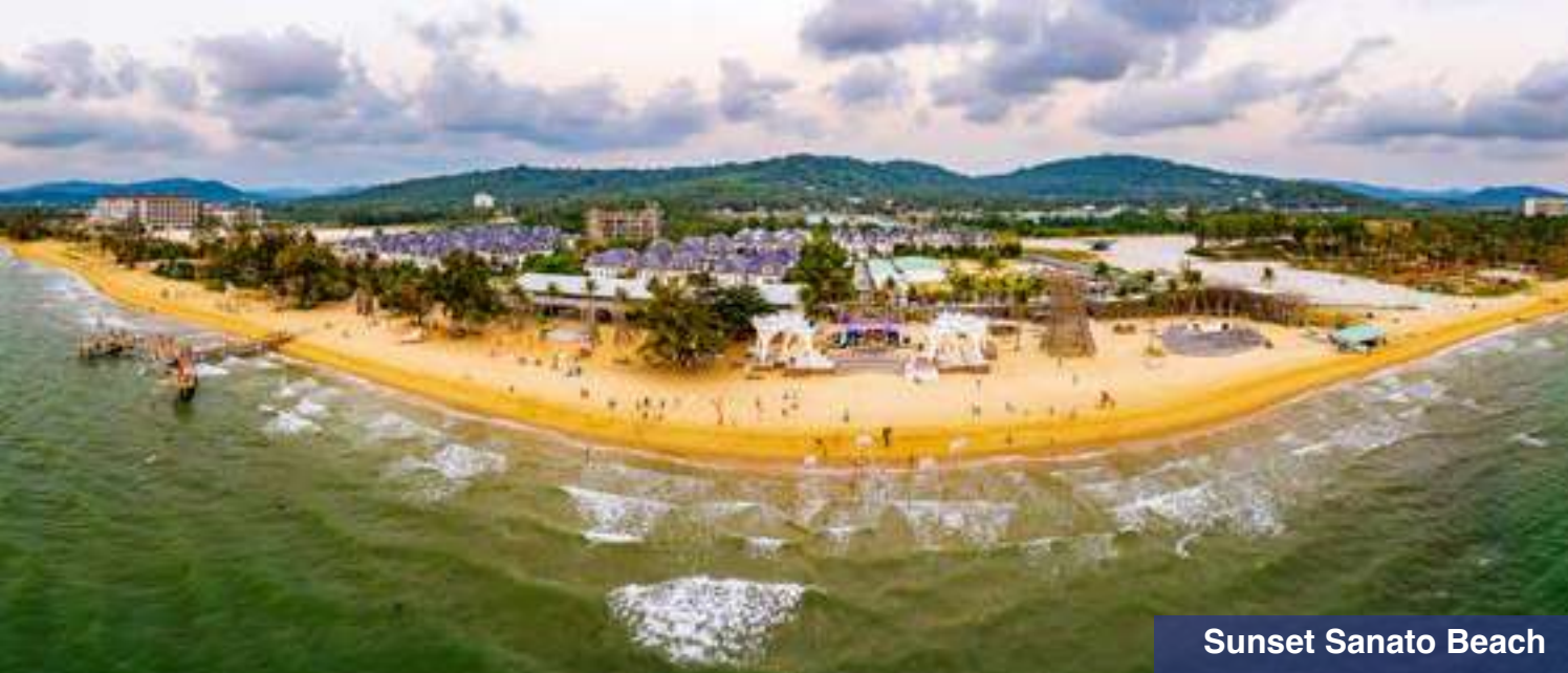
Sunset Sanato Beach