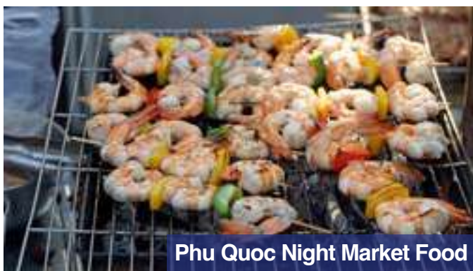
Phu Quoc Night Market Food