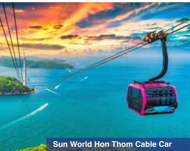
Sun World Hon Thom Cable Car