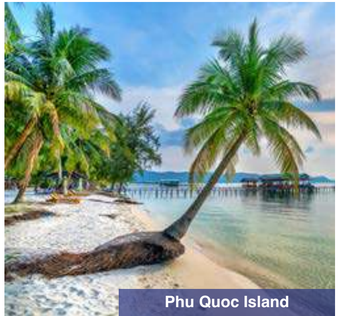
Phu Quoc Island