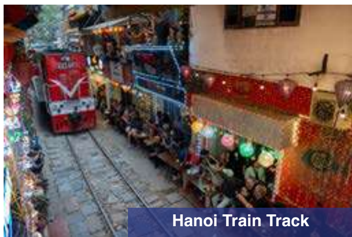
Hanoi Train Track

After breakfast, free at leisure then transfer to airport for flight home with sweet memories. Thank you for choosing Nam Ho Travel as your preferred agent for your vacation. We hope to see you soon in the near future.