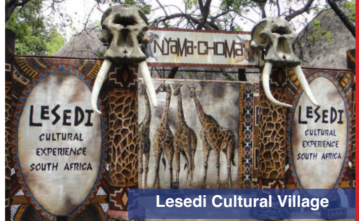
Lesedi Cultural Village