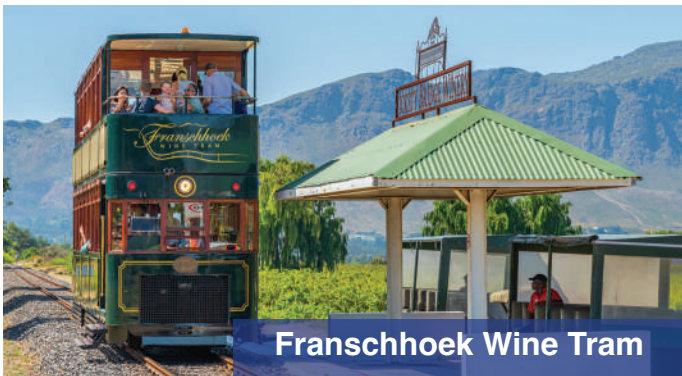
Franschhoek Wine Tram

Pre - Sunset Cruise - Set sail on a 90 minutes pre-sunset cruise and enjoy a glass of champagne. Sail along the Atlantic with a picturesque view of the Table Mountain and the Twelve Apostles Mountain Range (dependent on weather condition)