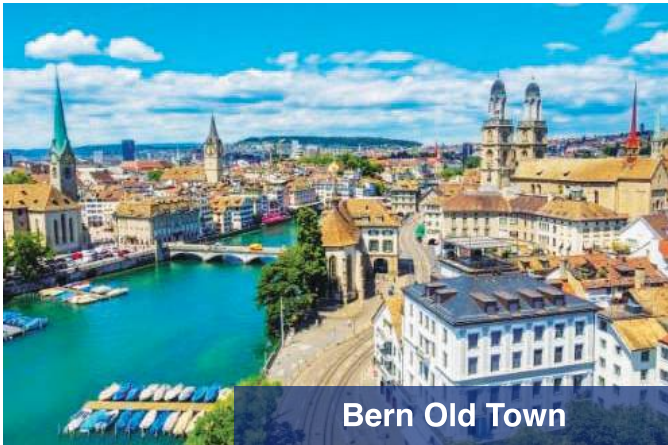
Bern Old Town

Bern - Capital of Switzerland, walking tour at old town, a UNESCO World Heritage Site. Photo stop at Bear Pit, Einstein House, Bern Cathedral, Zytglogge and Federal Palace. Overnight in Bern.