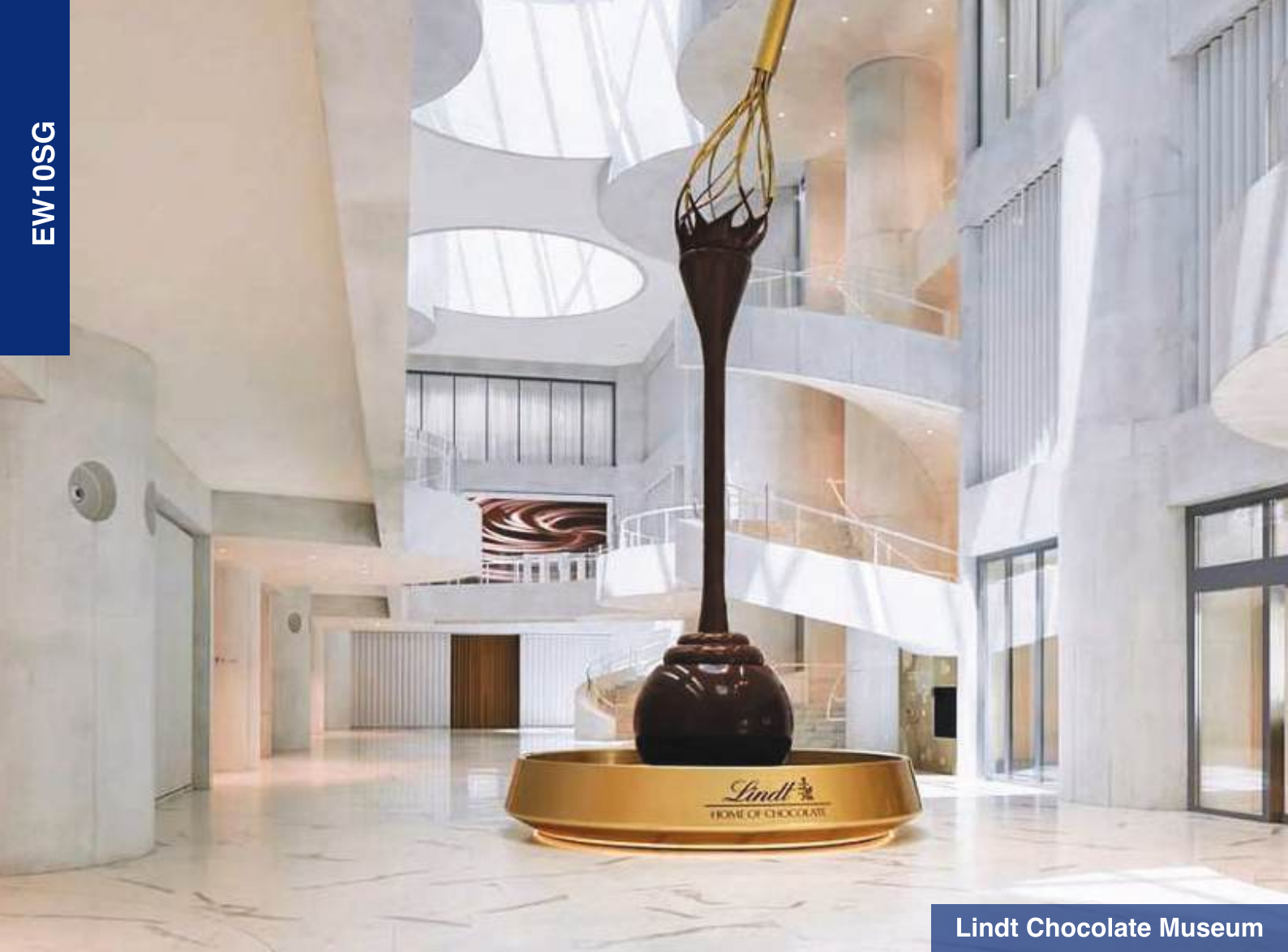
Lindt Chocolate Museum