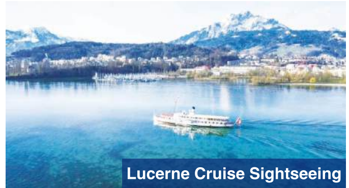
Lucerne Cruise Sightseeing