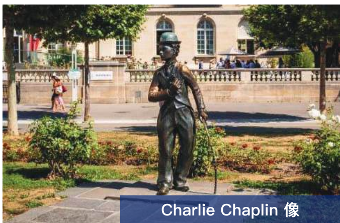
Charlie Chaplin 像