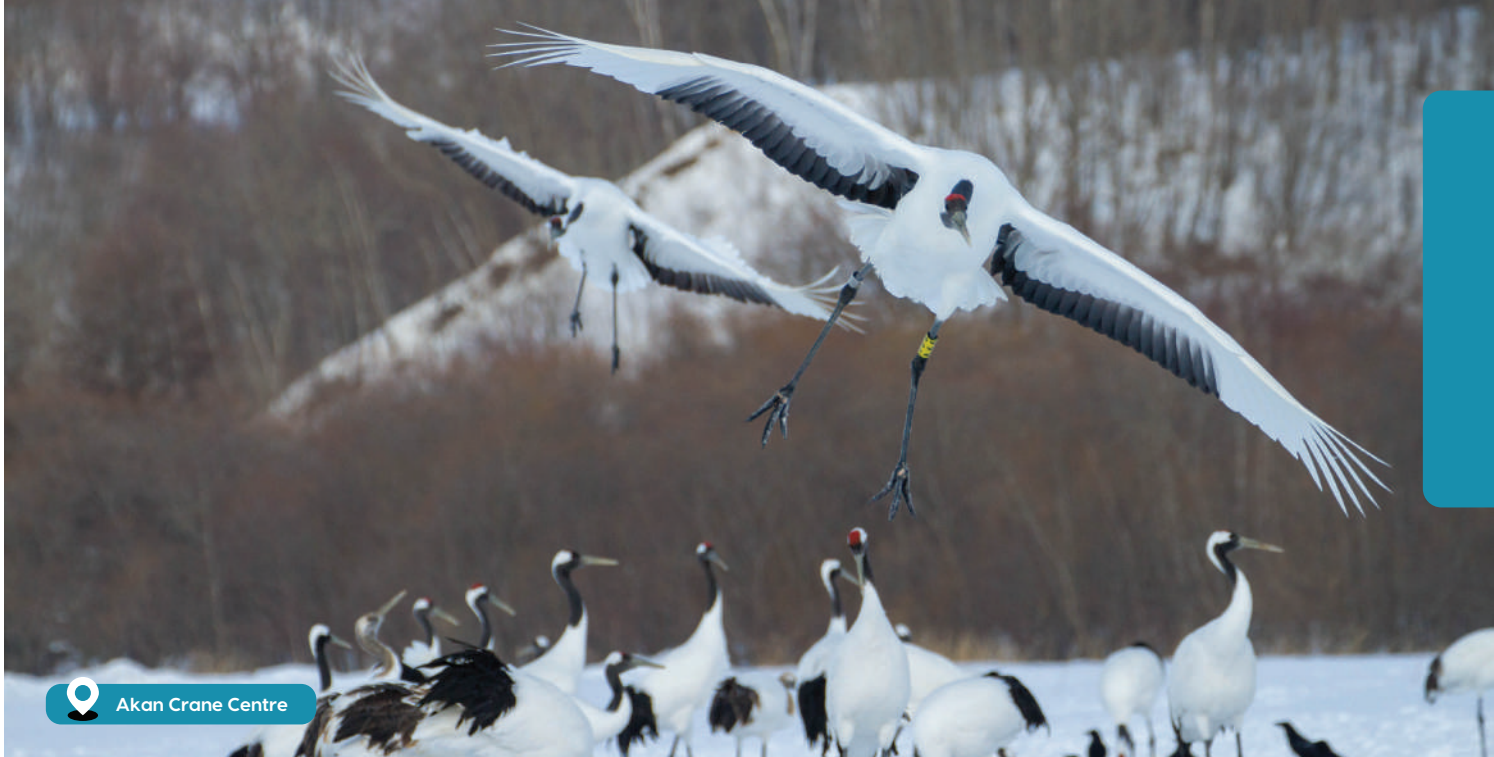
Akan Crane Centre