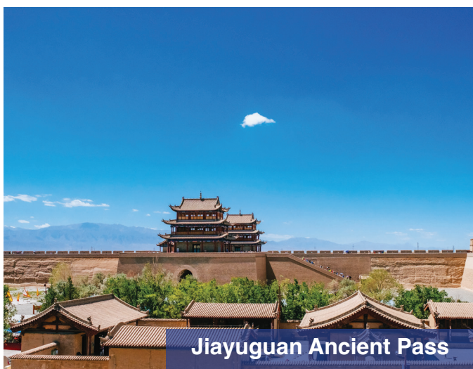
Jiayuguan Ancient Pass

Accommodation: Equivalent 4* Far East Warren Hotel or Vienna Hotel Jiuquan or similar