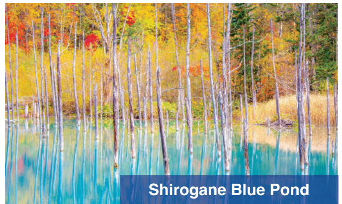
Shirogane Blue Pond

• Accommodation: Mystays premier park hotel Sapporo or similar