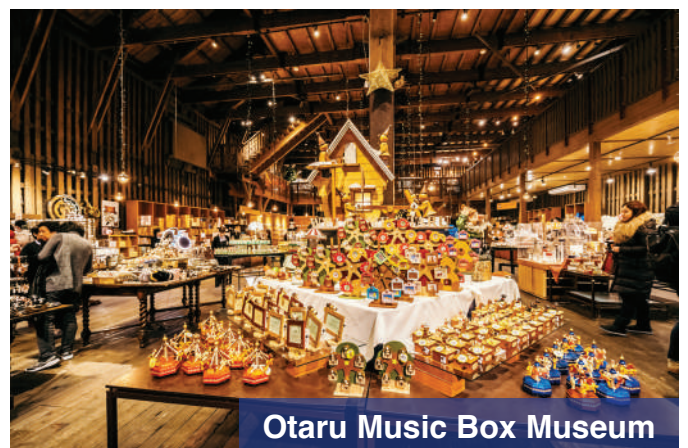
Otaru Music Box Museum