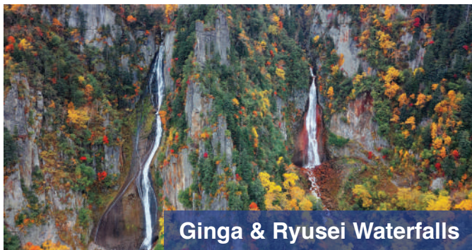
Ginga & Ryusei Waterfalls