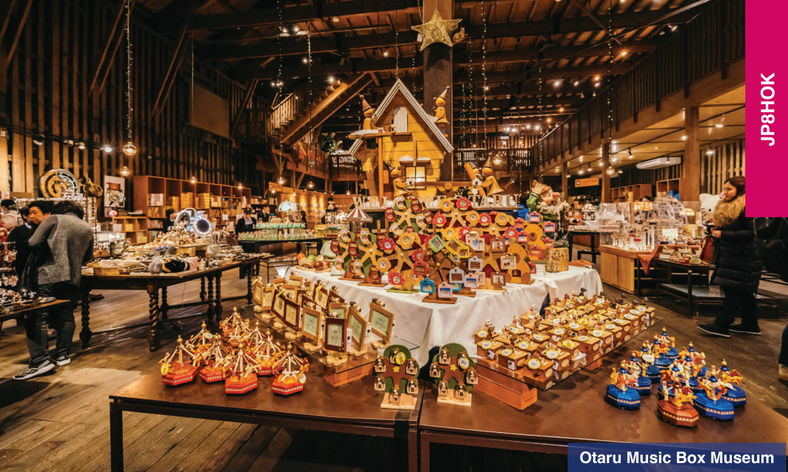
Otaru Music Box Museum