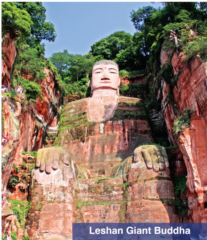
Leshan Giant Buddha

Complimentary Travel Photography at Kuanzhai Alley