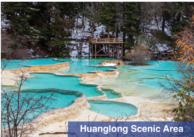
Huanglong Scenic Area