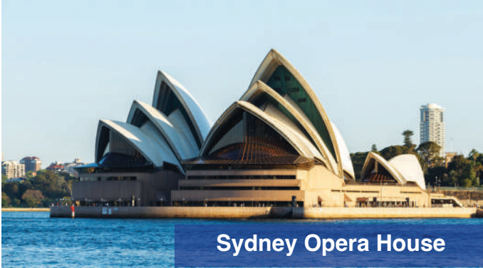
Sydney Opera House

After the city tour, transfer to your hotel for check-in.