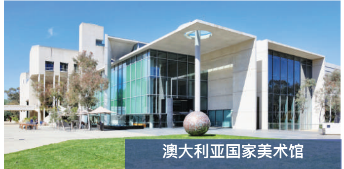
澳大利亚国家美术馆