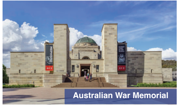
Australian War Memorial

Free day at own leisure to explore on your own.