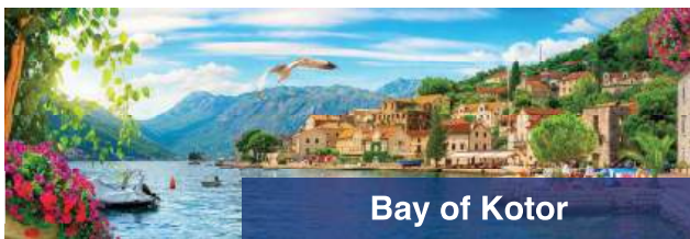
Bay of Kotor

Evening, Explore the shopping street, Calea Victoriei on your own.