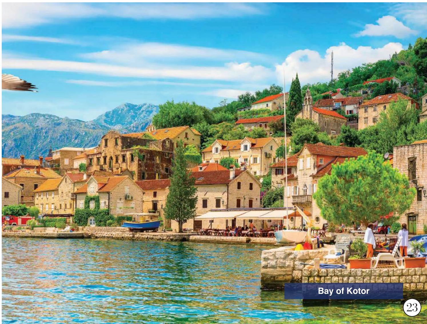
Bay of Kotor