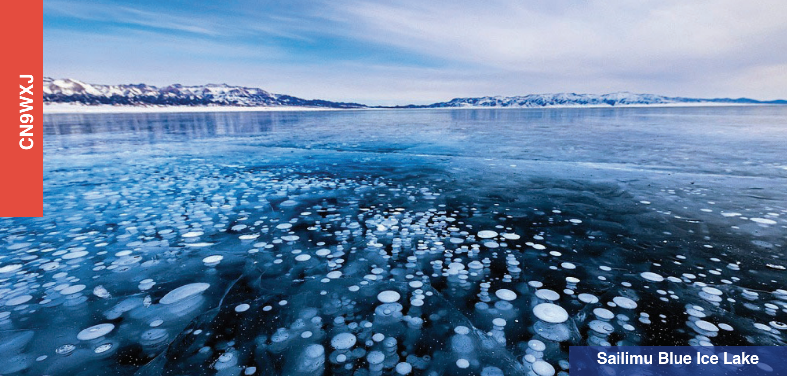
Sailimu Blue Ice Lake