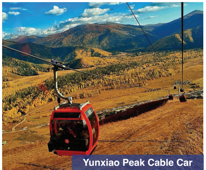
Yunxiao Peak Cable Car

Accommodation: equivalent 5* Sigema Hotel or similar