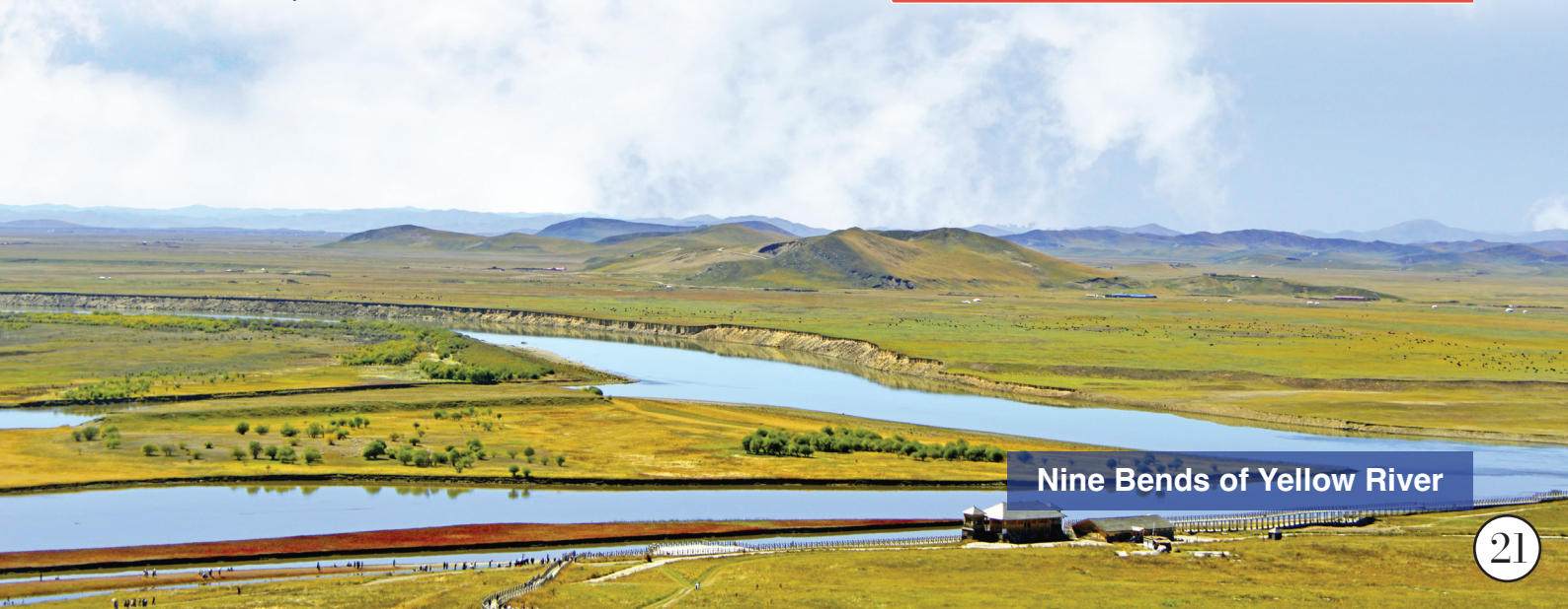
Nine Bends of Yellow River