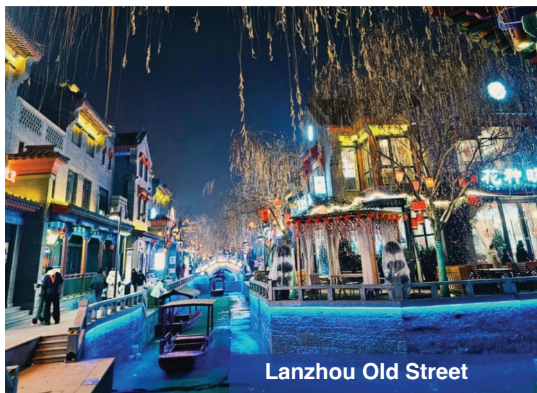
Lanzhou Old Street

• Heading to the airport for your flight back to Singapore