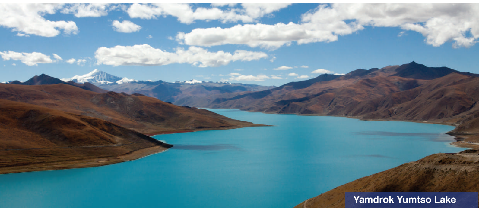
Yamdrok Yumtso Lake

Accommodation: 5* Lhasa Intercontinental Hotel or similar