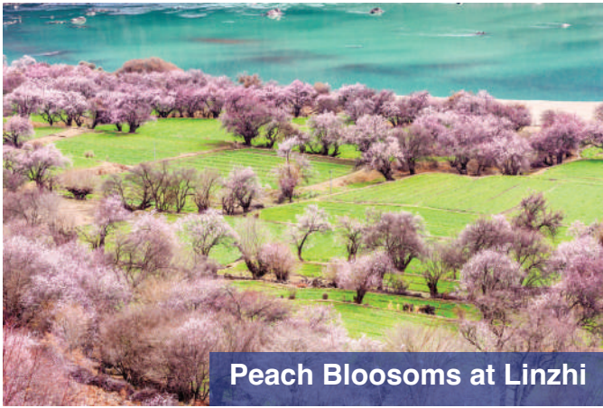
Peach Blossoms at Linzhi