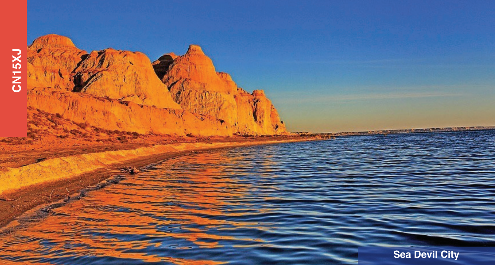
Sea Devil City