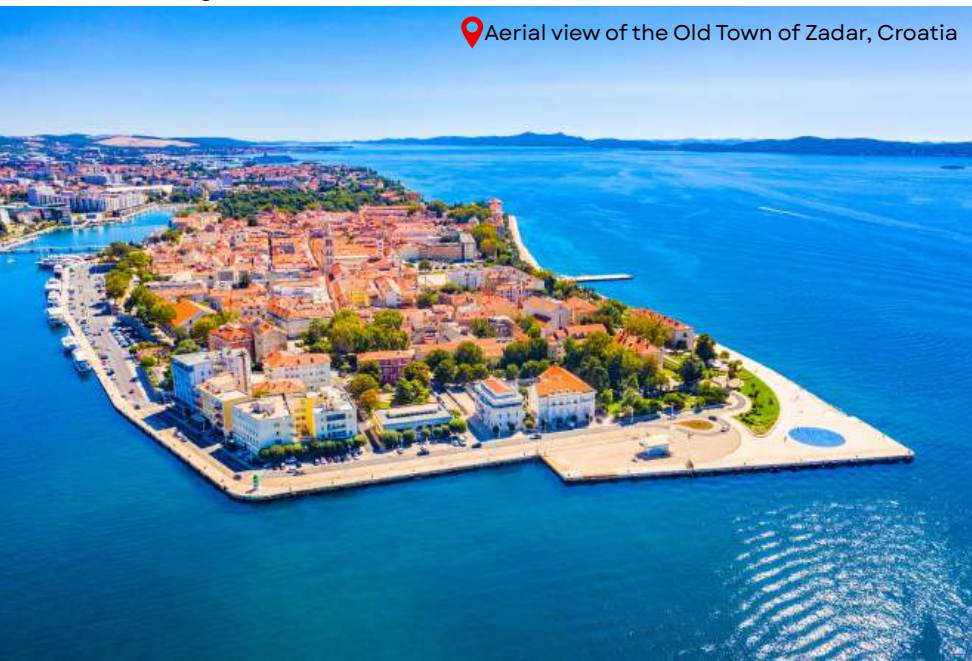
📍 Aerial view of the Old Town of Zadar, Croatia