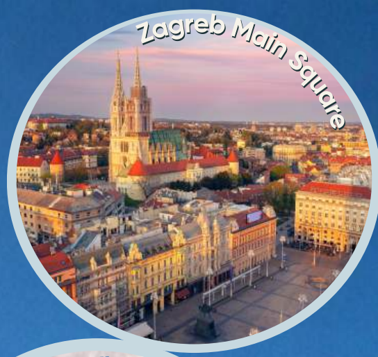
Zagreb Main Square