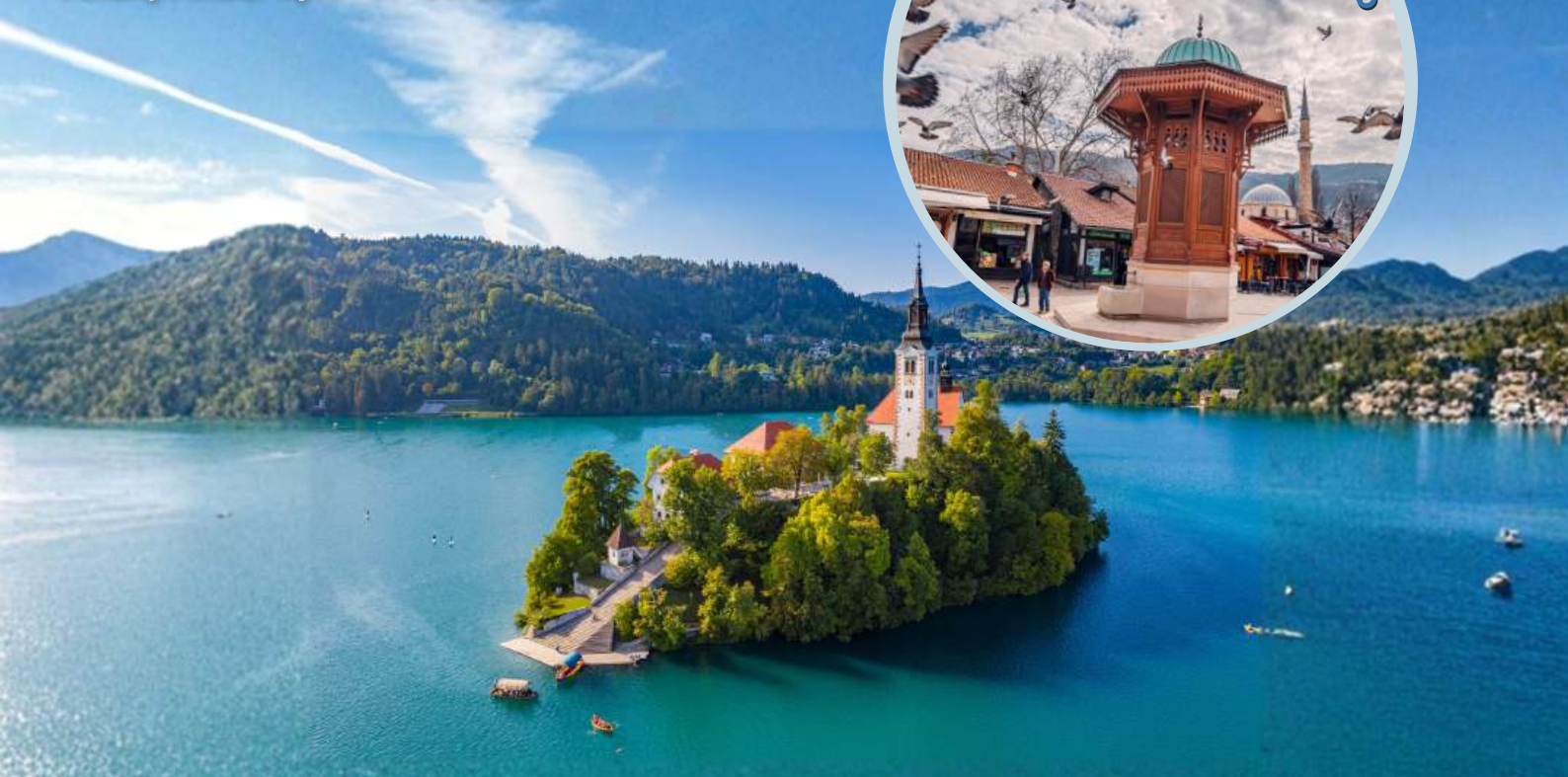
Where lake mist meets fairytale spires: discover Bled