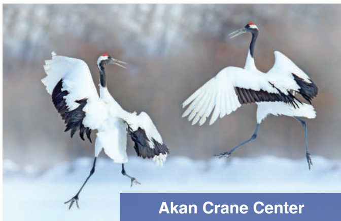
Akan Crane Center