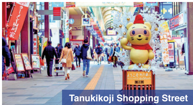
Tanukikoji Shopping Street