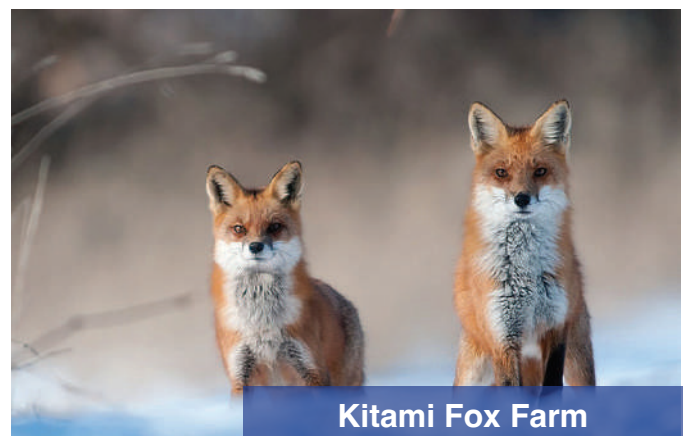
Kitami Fox Farm