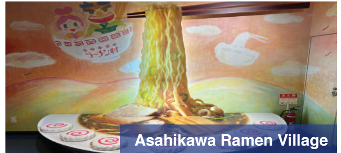
Asahikawa Ramen Village

• Asahikawa Ramen village - Ramen Village gives you 8 of Asahikawa's most well-known ramen shops in one location. • Sounkyo Ice Fall Festival (Late Jan – Mid Mar) - At the festival will see a variety of interesting ice sculptures such as an ice look out, an ice castle, ice tunnels and an ice slide. • Accommodation: Sounkyo Kanko or similar (Onsen Hot Spring)