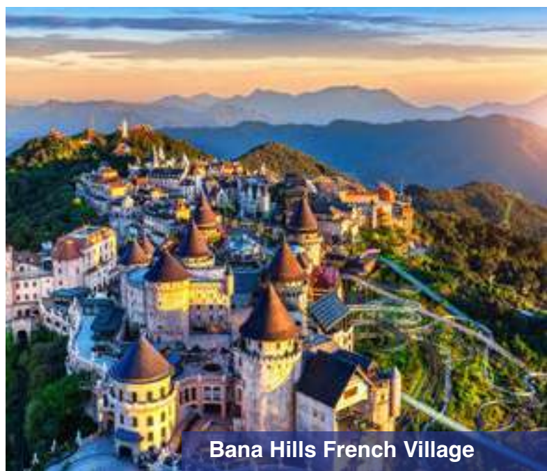
Bana Hills French Village