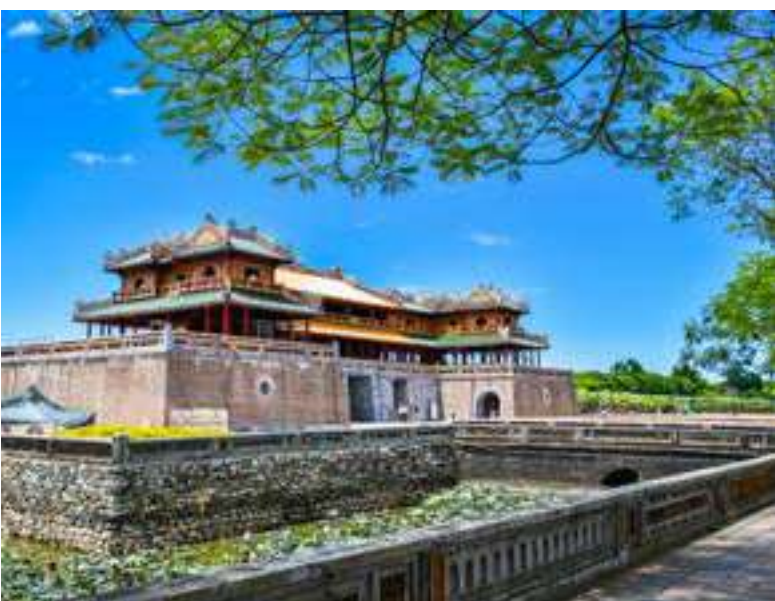
Hue Imperial Citadel

Imperial Royal Dinner in Hue with traditional attire.