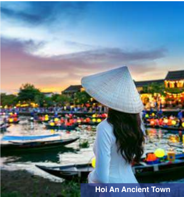
Hoi An Ancient Town

Overnight in Hoi An with an upgrade to a 5 star hotel