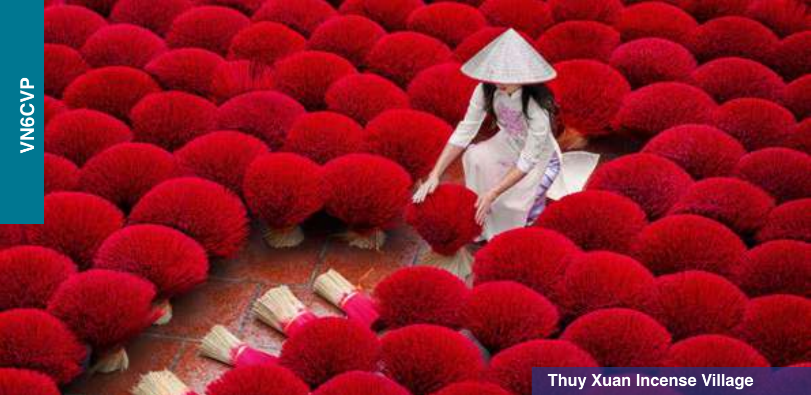
Thuy Xuan Incense Village