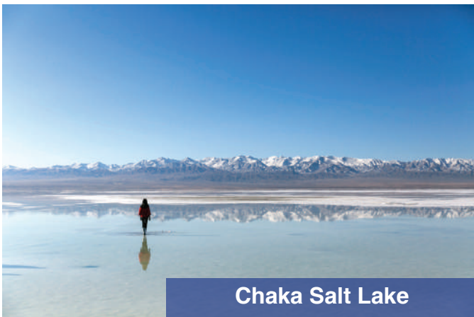
Chaka Salt Lake

Accommodation: 4* Jinhengji Hotel or Jintian Century Hotel or similar