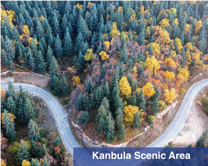
Kanbula Scenic Area

Accommodation: 4* Kanbula International Hotel or similar